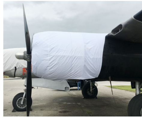
Douglas A-26 Engine Cover, test fit cover