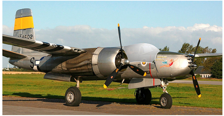
A-26 Invader Cockpit Cover (Illustration)