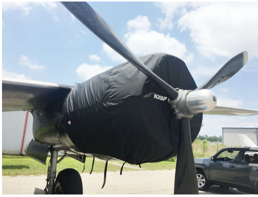
Douglas A-26 Engine Cover