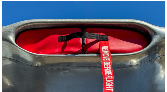
Douglas A26 Invader Oil Cooler Inlet Plugs