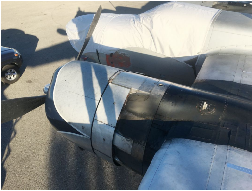
Douglas A-26 Cockpit/Nose Cover

the hottest of days. It is water, ice and snow repellent, yet breathable to allow moisture to escape from between the cover and the aircraft surface.