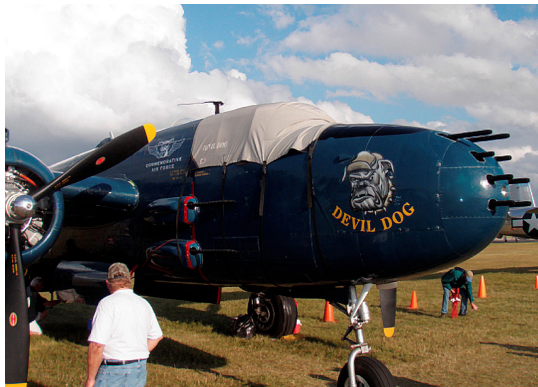
Mitchell B25 Cockpit Cover w/ Custom Imprint (Bellystrap Type)

Engine Inlet Plugs are custom fit for your Douglas A26 Invader intakes, made with heavy-duty vinyl material, and stuffed with a single block of sculpted urethane foam. Each plug has a zipper that allows the foam to be removed and dried if necessary. Engine plugs have warning flags that are visible from the cockpit or 'remove before flight' streamers sewn onto the face of the plugs. Most plugs are imprinted with the aircraft registration number in black for an extra charge. Storage bag NOT included. Engine plugs may be inserted after flight when the engine is still warm. Engine Inlet Plugs are commonly referred to as Cowl Plugs, Intake Plugs, Cowl Blocks, Engine Blocks, and Engine Bungs.