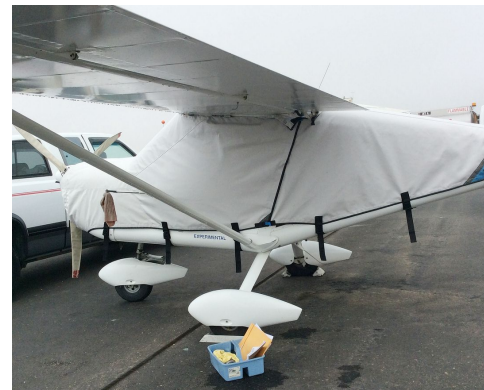
Aeroprakt A-22 Valor Capetown, Foxbat Canopy/Engine Cover