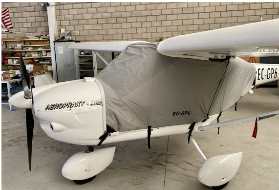
Aeroprakt A22 Over-Top Canopy Cover