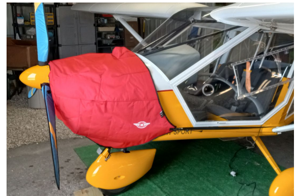
Aeroprakt A-22 Insulated Engine Cover