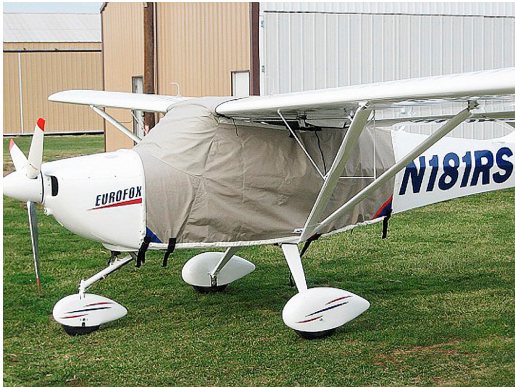
Eurofox LSA Extended Canopy Cover (same as an Aerotrek)

This cover type is made from Silver Acrylic Sunbrella canvas and is 100% lined with a soft and smooth microfiber. Bruce's Custom Covers developed this material combination especially for aircraft protection. The outer material is medium weight and treated for water resistance, UV resistance and anti-static buildup. The inner lining is a very soft and smooth microfiber to prevent scratching. The material is very reflective, and tests show that the cabin interior temperature can be reduced to near-ambient temperature on the hottest of days. It is water, ice and snow repellent, yet breathable to allow moisture to escape from between the cover and the aircraft surface.