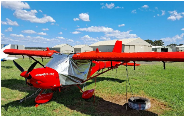
Aeroprakt A22 Wing & Empennage Covers