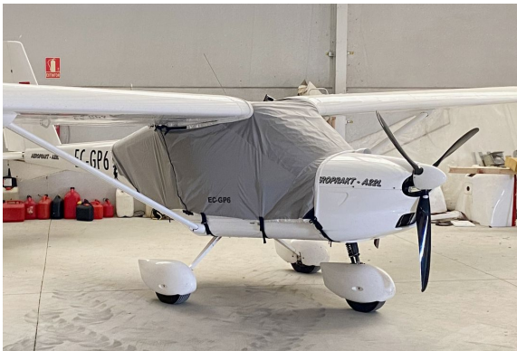
Aeroprakt A22 Over-Top Canopy Cover

Travel Covers are made with Silver Solution-Dyed Polyester fabric and only lined over the windshield to save weight. The material is lightweight and more compact for easy stowage in the aircraft. The polyester material is water resistant, but only intended for occasional use outside. We also have an ultra lightweight material available for fitted hangar dust covers. For daily outdoor use, the non-travel Sunbrella Cover is the best choice.