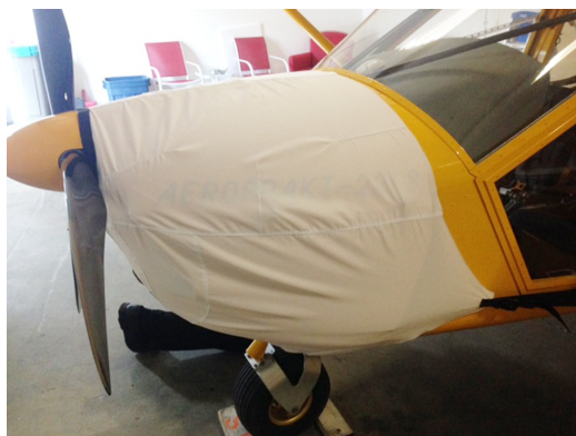
A-22 Engine Cover, test fit

Insulated Covers Material - A special composite material of solution-dyed polyester, 3M Thinsulate insulation, and soft nylon interior fabric. Our insulated covers are designed to complement an engine preheater and help retain heat in the engine compartment after shutdown. If you operate your aircraft in cold-weather, these covers will help prevent engine wear and tear.