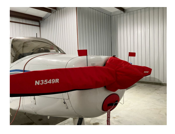
Beech A23 Musketeer Insulated Prop Cover, Engine Plugs