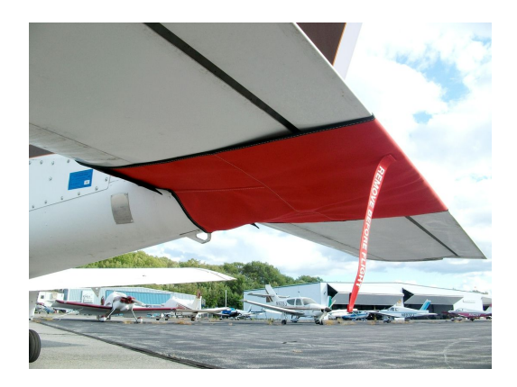
Beech Musketeer Tailcone Cover (Fully Enclosed)