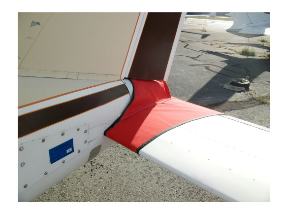
Beech Musketeer Tailcone Cover (Fully Enclosed)

WINTER USE MATERIAL - Made with Solution-Dyed Polyester fabric, this option is intended for seasonal use to aid in deicing, rain mitigation, or for occasional travel. The material is lighter and more compact, but more susceptible to UV damage and may have a shorter useful life if used continuously outside than the all-year use material.