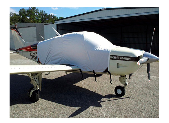
Beech Sport Extended Canopy Cover

This cover type is made from Silver Acrylic Sunbrella canvas and is 100% lined with a soft and smooth microfiber. Bruce's Custom Covers developed this material combination especially for aircraft protection. The outer material is medium weight and treated for water resistance, UV resistance and anti-static buildup. The inner lining is a very soft and smooth microfiber to prevent scratching. The material is very reflective, and tests show that the cabin interior temperature can be reduced to near-ambient temperature on the hottest of days. It is water, ice and snow repellent, yet breathable to allow moisture to escape from between the cover and the aircraft surface.