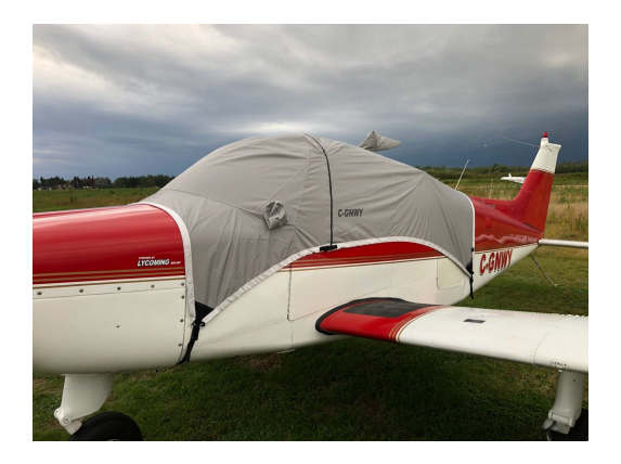
Beech Sundowner Travel Canopy Cover