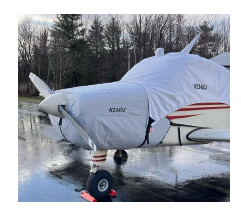
Beech Musketeer Insulated Engine Cover