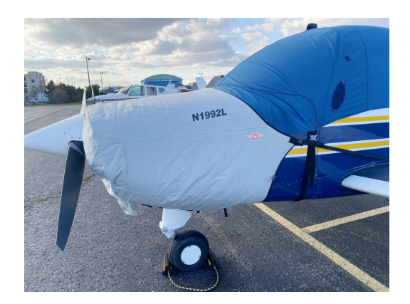
Beech C23 Sundowner Insulated Engine Cover

This cover type is made from Silver Acrylic Sunbrella canvas and is 100% lined with a soft and smooth microfiber. Bruce's Custom Covers developed this material combination especially for aircraft protection. The outer material is medium weight and treated for water resistance, UV resistance and anti-static buildup. The inner lining is a very soft and smooth microfiber to prevent scratching. The material is very reflective, and tests show that the cabin interior temperature can be reduced to near-ambient temperature on the hottest of days. It is water, ice and snow repellent, yet breathable to allow moisture to escape from between the cover and the aircraft surface.