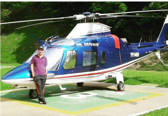
Agusta Power Cockpit & Cabin HeatShields

Cockpit Heatshields are interior sunshades for the aircraft's cockpit. The product is a unique composite of closed-cell foam with a silver mylar finish. The semi-rigid design is stiff enough to stand inside the window framing. Darts and folds are incorporated into the material so that it conforms to the complex shape of the helicopter windows. The set folds up flat and is easily stored in the included storage sleeve. Some designs may require velcro and suction cups. A Heatshield is an excellent short-term remedy for cockpit overheating, but an external fabric cover is more effective for long-term protection.