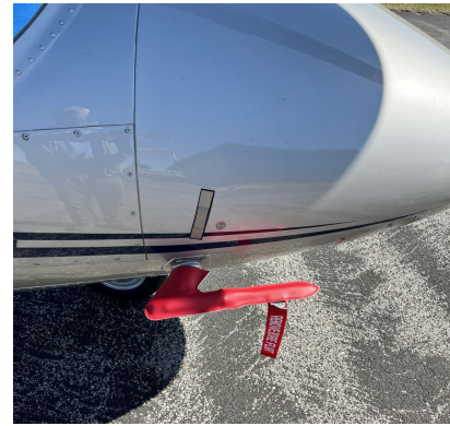
Agusta AW109 (A, C, & Trekker) Pitot Cover Set