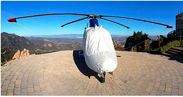
Agusta 109 Mk II+ Bubble Cover and Blade Tie-downs