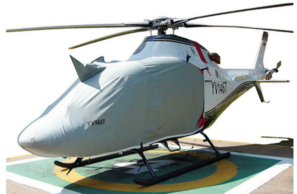
Koala Bubble Cover (with Wire Strike)