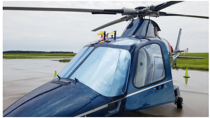
Agusta AW109S/SP Grand Heatshield Set