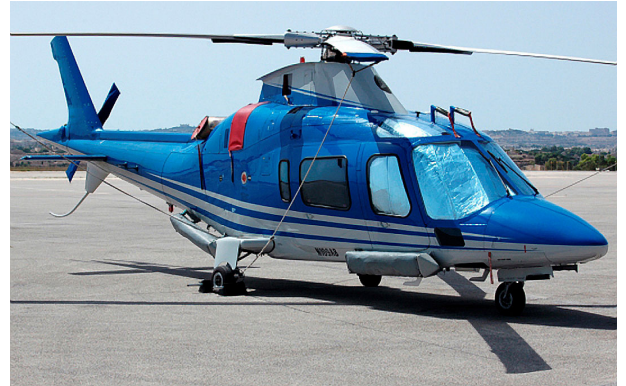
Agusta Power Pitot Covers, Intake Covers, and Cockpit Heatshield set