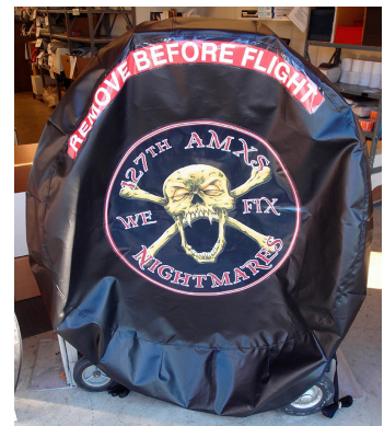
A-10 Engine Intake Cover