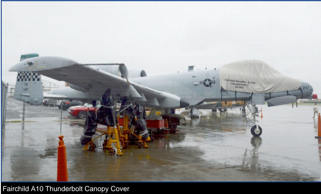
Fairchild A10 Thunderbolt Canopy Cover