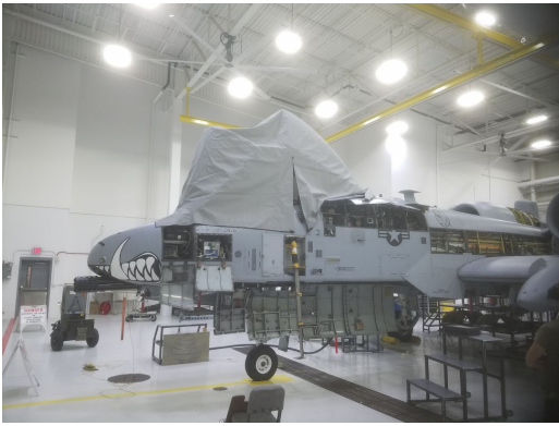
Fairchild A-10 Canopy Cover, open position