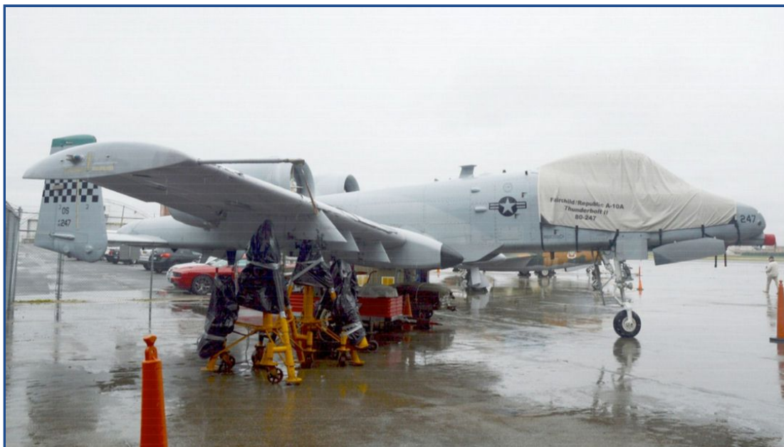
Fairchild A10 Thunderbolt Canopy Cover