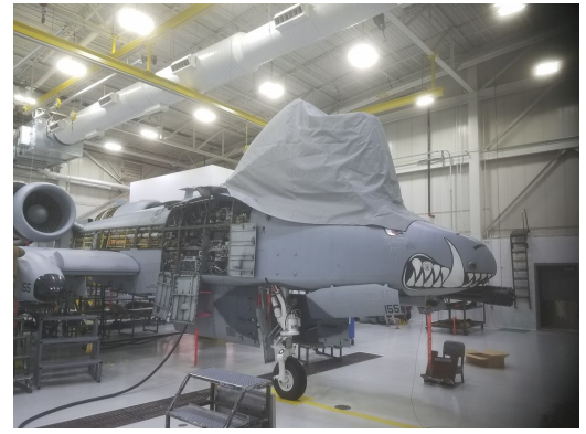
Fairchild A10 Thunderbolt Canopy Cover, Nose Gun Cover, Gun Scoop Inlet Plug Fairchild A-10 Canopy Cover, open position