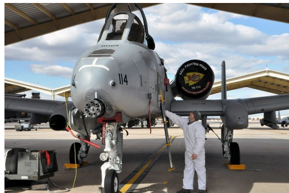
Fairchild A10 Intake Covers & Nose Gun Scoop Plug