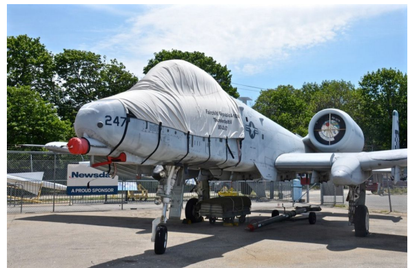
Fairchild A10 Thunderbolt Nose Gun Cover, Gun Scoop Inlet Plug