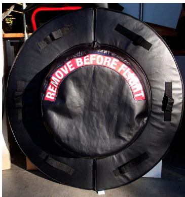
A-10 Exhaust Plug/Cover

The Engine Inlet Plugs are custom fit for your Fairchild A10 Thunderbolt intakes, made with heavy-duty vinyl material, and stuffed with a single block of sculpted urethane foam. Each plug has a zipper that allows the foam to be removed and dried if necessary. Engine plugs have 'remove before flight' streamers sewn onto the face of the plugs. Most plugs are imprinted with the aircraft registration number in black for an extra charge. Storage bag NOT included. Engine plugs may be inserted after flight when the engine is still warm. Engine Inlet Plugs are commonly referred to as Cowl Plugs, Intake Plugs, Cowl Blocks, Engine Blocks, and Engine Bungs.