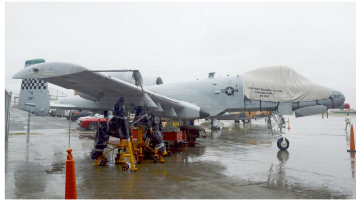
Fairchild A10 Thunderbolt Canopy Cover