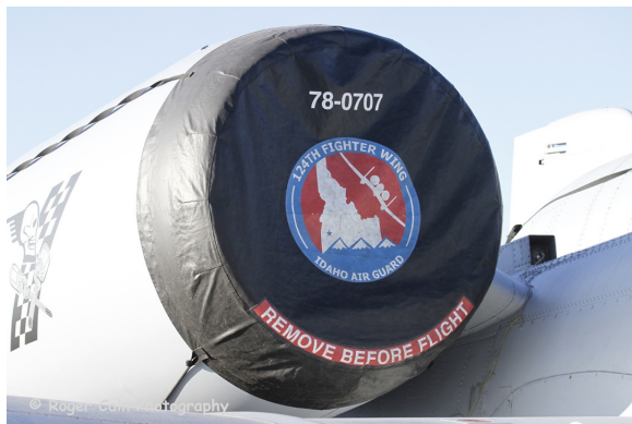
Fairchild A-10 Engine Covers

ALL-YEAR USE MATERIAL - Made with Solution dyed Polyester fabric, the all-year use material is the best option for sun protection and cover longevity. This heavier more durable material is intended for all weather conditions, such as rain and snow or lots of sun.