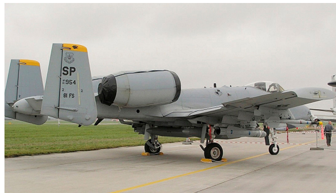
A-10 Engine Covers