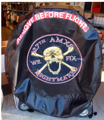
A-10 Engine Intake Cover

ALL-YEAR USE MATERIAL - Made with Solution dyed Polyester fabric, the all-year use material is the best option for sun protection and cover longevity. This heavier more durable material is intended for all weather conditions, such as rain and snow or lots of sun.