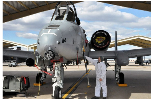
Fairchild A10 Intake Covers & Nose Gun Scoop Plug