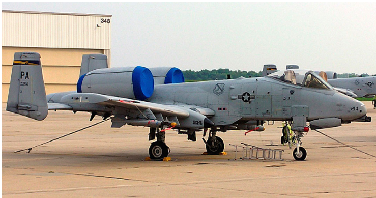
A-10 Engine Covers

ALL-YEAR USE MATERIAL - Made with Solution dyed Polyester fabric, the all-year use material is the best option for sun protection and cover longevity. This heavier more durable material is intended for all weather conditions, such as rain and snow or lots of sun.