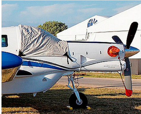
750XL Cockpit Cover & Prop Tie/Exhaust Covers

This cover type is made from Silver Acrylic Sunbrella canvas and is 100% lined with a soft and smooth microfiber. Bruce's Custom Covers developed this material combination especially for aircraft protection. The outer material is medium weight and treated for water resistance, UV resistance and anti-static buildup. The inner lining is a very soft and smooth microfiber to prevent scratching. The material is very reflective, and tests show that the cabin interior temperature can be reduced to near-ambient temperature on the hottest of days. It is water, ice and snow repellent, yet breathable to allow moisture to escape from between the cover and the aircraft surface.