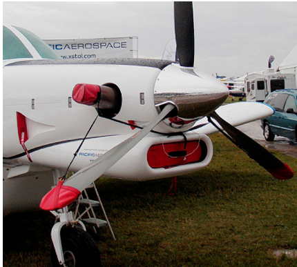
750XL Engine Inlet Plugs & Prop Tie/Exhaust Covers

This cover type is made from Silver Acrylic Sunbrella canvas and is 100% lined with a soft and smooth microfiber. Bruce's Custom Covers developed this material combination especially for aircraft protection. The outer material is medium weight and treated for water resistance, UV resistance and anti-static buildup. The inner lining is a very soft and smooth microfiber to prevent scratching. The material is very reflective, and tests show that the cabin interior temperature can be reduced to near-ambient temperature on the hottest of days. It is water, ice and snow repellent, yet breathable to allow moisture to escape from between the cover and the aircraft surface.