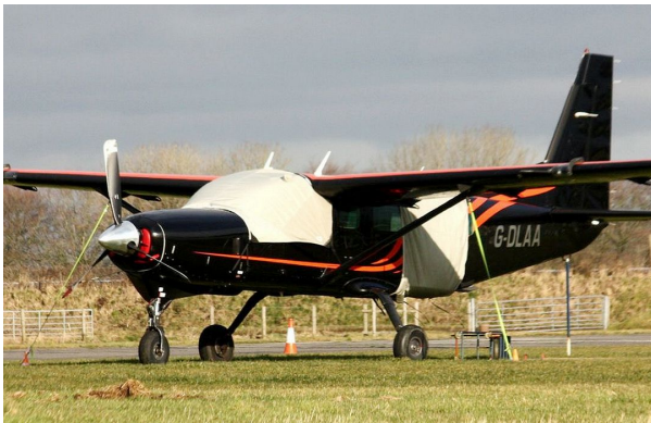
Cessna Caravan Cockpit Cover, Engine Plugs, Jump Door Cover