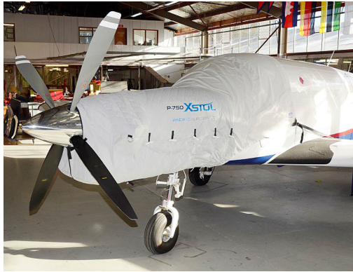
750XL Combination Insulated Engine Cover/Cockpit Cover

The material is very reflective, and tests show that the cabin interior temperature can be reduced to near-ambient temperature on the hottest of days. It is water, ice and snow repellent, yet breathable to allow moisture to escape from between the cover and the aircraft surface.