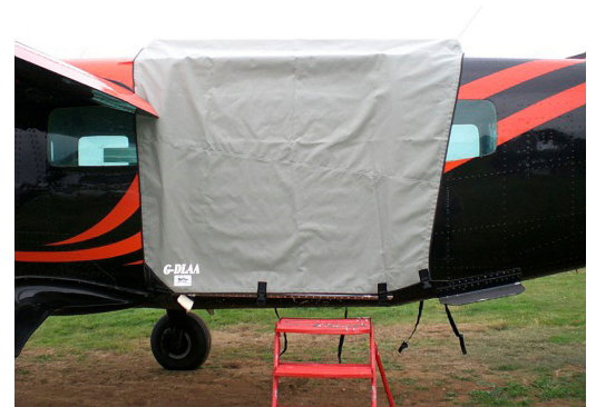
Cessna 208 Caravan Jump Door Cover