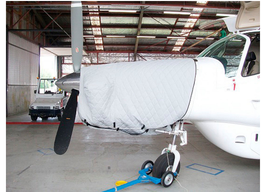
750XL Insulated Engine Cover