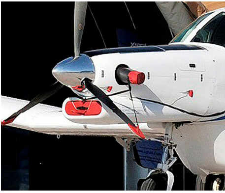
750XL Engine Inlet Plugs & Prop Tie/Exhaust Covers