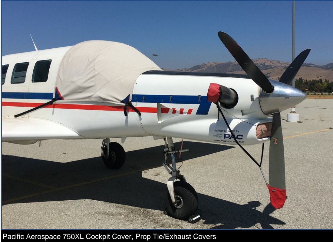
Pacific Aerospace 750XL Cockpit Cover, Prop Tie/Exhaust Covers