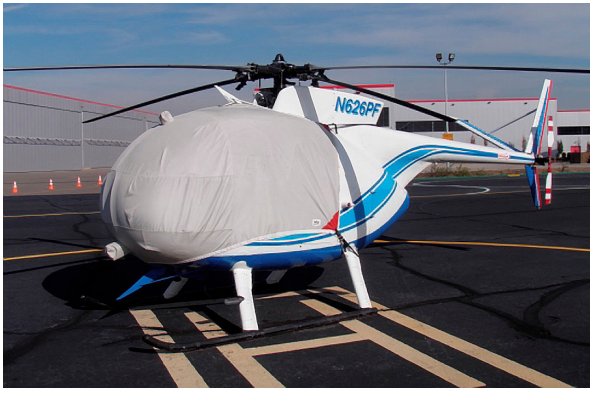
MD500C Bubble Cover with Wire Strike detail