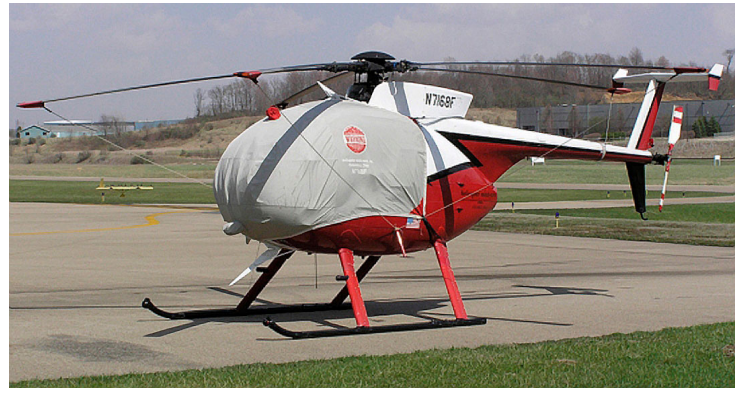
Hughes 500D Bubble Cover with Wire Strike detail and Blade Tie-downs