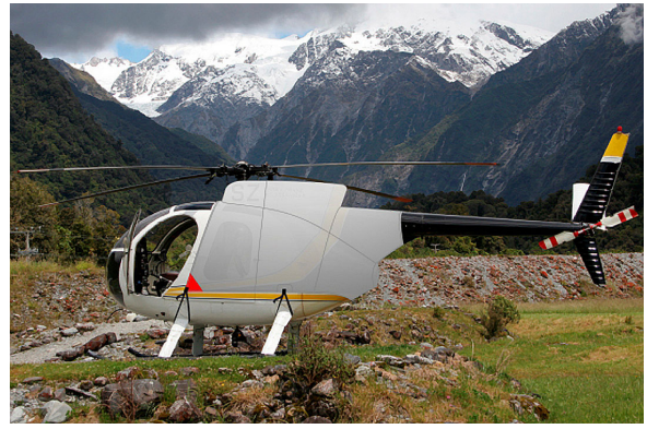
Engine Cover (illustration)