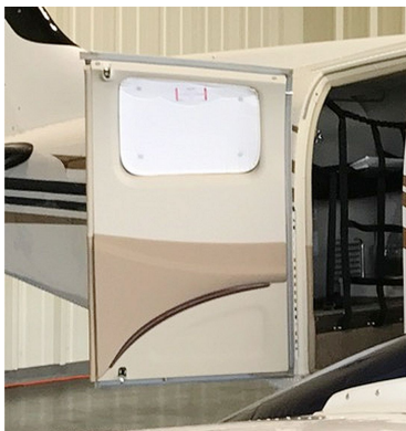
Beech Baron 58 Cabin HeatShield

Windshield Heatshields are interior sunshades for an aircraft's front windshield. The product is a unique composite of closed-cell foam with a silver mylar finish. The semi-rigid design is stiff enough to stand along the inside of the windshield using sun visors or window framing. It folds up flat and easily stores in the included storage sleeve. Some designs may require velcro and suction cups or split right and left sides. A Heatshield is an excellent short-term remedy for cockpit overheating. An external fabric cover is far more effective and practical for long-term protection.