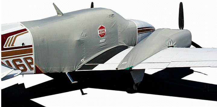
Baron Extended Canopy Cover & Engine Covers

This cover type is made from Silver Acrylic Sunbrella canvas and is 100% lined with a soft and smooth microfiber. Bruce's Custom Covers developed this material combination especially for aircraft protection. The outer material is medium weight and treated for water resistance, UV resistance and anti-static buildup. The inner lining is a very soft and smooth microfiber to prevent scratching. The material is very reflective, and tests show that the cabin interior temperature can be reduced to near-ambient temperature on the hottest of days. It is water, ice and snow repellent, yet breathable to allow moisture to escape from between the cover and the aircraft surface.