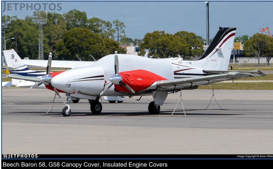
Beech Baron 58, G58 Canopy Cover, Insulated Engine Covers