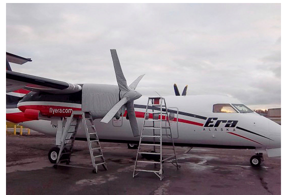
Dash 8 Insulated Engine & Prop Covers