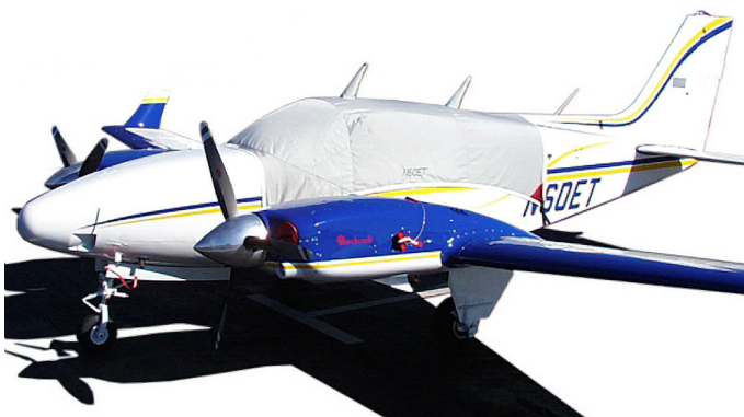
Standard Canopy Cover & Engine Plugs

This cover type is made from Silver Acrylic Sunbrella canvas and is 100% lined with a soft and smooth microfiber. Bruce's Custom Covers developed this material combination especially for aircraft protection. The outer material is medium weight and treated for water resistance, UV resistance and anti-static buildup. The inner lining is a very soft and smooth microfiber to prevent scratching. The material is very reflective, and tests show that the cabin interior temperature can be reduced to near-ambient temperature on the hottest of days. It is water, ice and snow repellent, yet breathable to allow moisture to escape from between the cover and the aircraft surface.