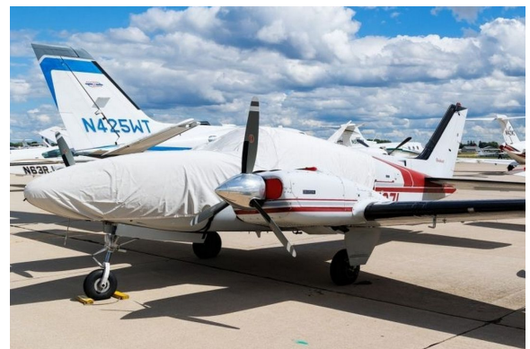
Beech Baron D55 Canopy/Nose Cover