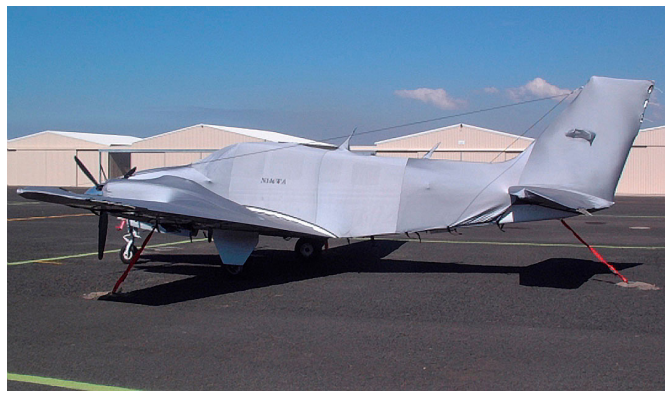
Baron FULL COVER SET, Light Weight Travel &/or Fitted Dust Cover Set