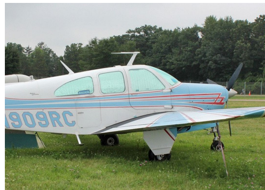
Beech Bonanza/Debonair HeatShield Set