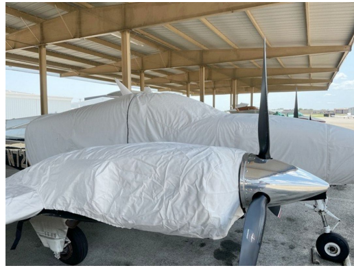
Beech Baron 58P Extended Canopy/Nose Cover, Wing/Engine Covers (test fit)