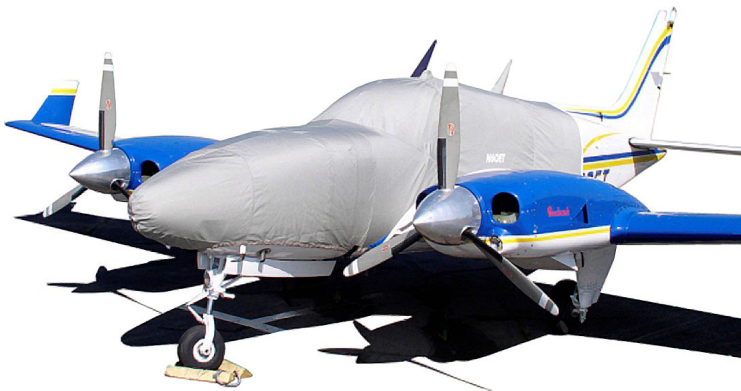
Baron Canopy/Nose Cover

Travel Covers are made with Silver Solution-Dyed Polyester fabric and only lined over the windshield to save weight. The material is lightweight and more compact for easy stowage in the aircraft. The polyester material is water resistant, but only intended for occasional use outside. We also have an ultra lightweight material available for fitted hangar dust covers. For daily outdoor use, the non-travel Sunbrella Cover is the best choice.