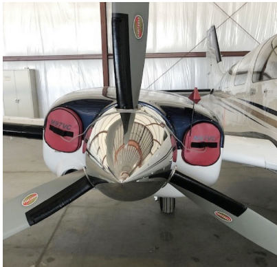
Beech Baron 58P Engine Inlet Plugs

Engine Inlet Plugs are custom fit for your Beech Baron 58TC intakes, made with heavy-duty vinyl material, and stuffed with a single block of sculpted urethane foam. Each plug has a zipper that allows the foam to be removed and dried if necessary. Engine plugs have warning flags that are visible from the cockpit or 'remove before flight' streamers sewn onto the face of the plugs. Most plugs are imprinted with the aircraft registration number in black for an extra charge. Storage bag NOT included. Engine plugs may be inserted after flight when the engine is still warm. Engine Inlet Plugs are commonly referred to as Cowl Plugs, Intake Plugs, Cowl Blocks, Engine Blocks, and Engine Bungs.