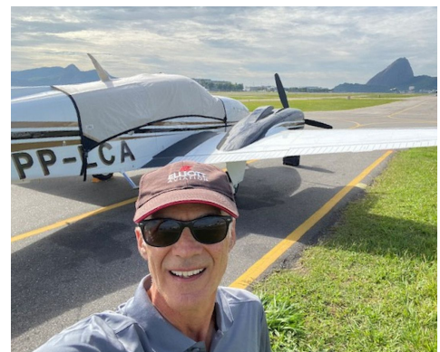
Beech G58 Baron Canopy Cover