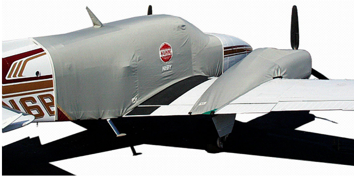
Baron Extended Canopy Cover & Engine Covers