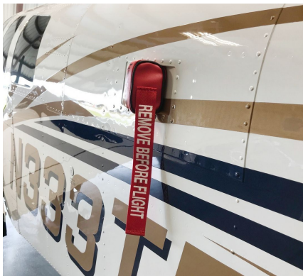
Beech Baron Fresh Air Outlet Plug

Engine Inlet Plugs are custom fit for your Beech Baron 58P intakes, made with heavy-duty vinyl material, and stuffed with a single block of sculpted urethane foam. Each plug has a zipper that allows the foam to be removed and dried if necessary. Engine plugs have warning flags that are visible from the cockpit or 'remove before flight' streamers sewn onto the face of the plugs. Most plugs are imprinted with the aircraft registration number in black for an extra charge. Storage bag NOT included. Engine plugs may be inserted after flight when the engine is still warm. Engine Inlet Plugs are commonly referred to as Cowl Plugs, Intake Plugs, Cowl Blocks, Engine Blocks, and Engine Bungs.