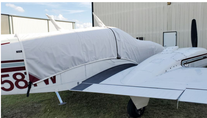
Beech Baron 58 Canopy/Nose Cover

This cover type is made from Silver Acrylic Sunbrella canvas and is 100% lined with a soft and smooth microfiber. Bruce's Custom Covers developed this material combination especially for aircraft protection. The outer material is medium weight and treated for water resistance, UV resistance and anti-static buildup. The inner lining is a very soft and smooth microfiber to prevent scratching. The material is very reflective, and tests show that the cabin interior temperature can be reduced to near-ambient temperature on the hottest of days. It is water, ice and snow repellent, yet breathable to allow moisture to escape from between the cover and the aircraft surface.