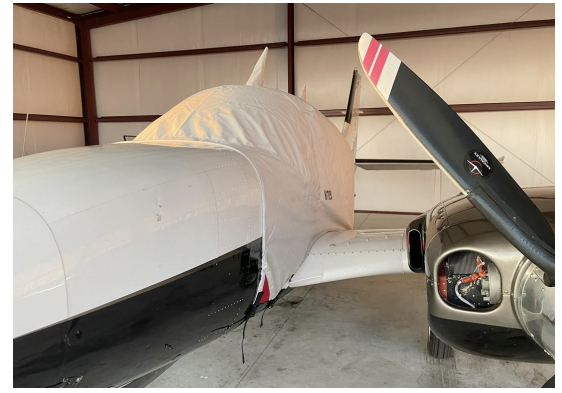
Beech Baron 58TC Extended Canopy Cover