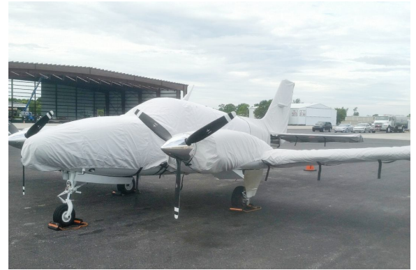
Full Cover Set (58P-020, 58P-225, 58P-405)