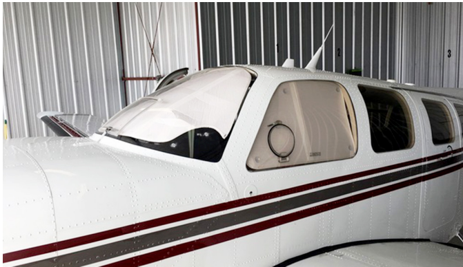
Beech Baron 58P Cockpit Heatshield Set

Heatshields are interior sunshades for an aircraft's windows or canopy glass. The product is a unique composite of closed-cell foam with a silver mylar finish. The semi-rigid design is stiff enough to stand along the inside of the windshield using sun visors or window framing. It folds up flat and easily stores in the included storage sleeve. Some designs may require velcro and suction cups. A Heatshield is an excellent short-term remedy for cockpit overheating.