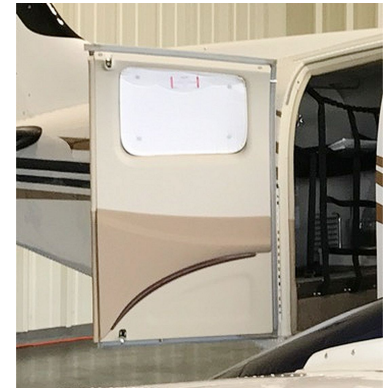
Beech Baron 58 Cabin HeatShield