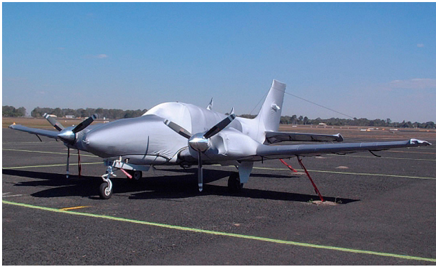
Baron FULL COVER SET, Light Weight Travel &/or Fitted Dust Cover Set