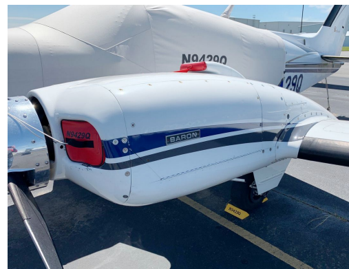
Beech Baron 58 Engine Plugs