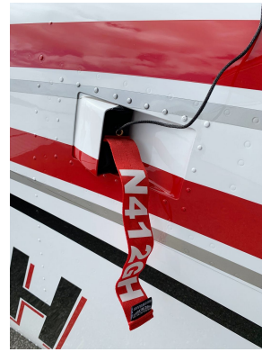
Beech Baron G58 Cabin Air Outlet Plug