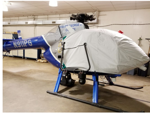
McDonnell Douglas MDD 520 Notar Bubble Cover, with special missions equipment.