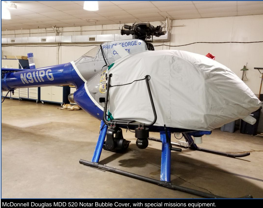
McDonnell Douglas MDD 520 Notar Bubble Cover, with special missions equipment.