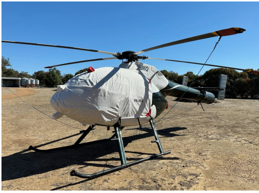
MDD 520 NOTAR Bubble Cover w/Intake Cover Add-On