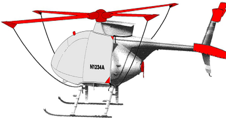
Full Cover Set

The Tailboom Cover details vary by model, but generally the helicopter tail boom cover encloses the tail boom from the "bottleneck" to the aft end. They usually also cover the horizontal stabilizers, and are custom made to allow for antennae, lights, and other protrusions. They attach with straps underneath the tail boom. Covers for the vertical and horizontal stabilizers are also available separately. Specific information for each model is available on request.