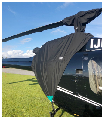
Bell 505 Engine, Rotor Mast & Blade Covers