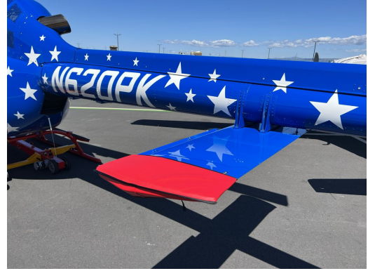
Bell 505 Horizontal Stabilizer Tip Pads