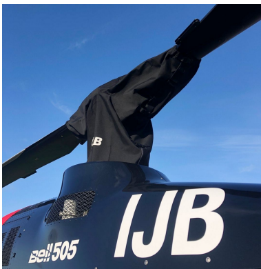
Bell 505 Rotor Mast & Blade Covers

WINTER USE MATERIAL - Made with Solution-Dyed Polyester fabric, this option is intended for seasonal use to aid in deicing, rain mitigation, or for occasional travel. The material is lighter and more compact, but more susceptible to UV damage and may have a shorter useful life if used continuously outside than the all-year use material.