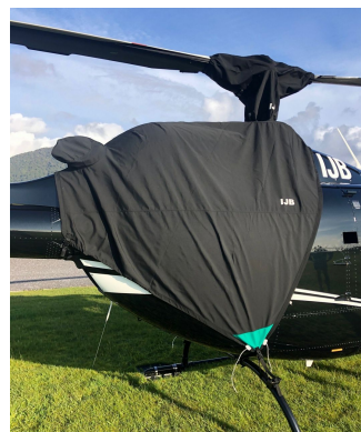
Bell 505 Engine, Rotor Mast & Blade Covers