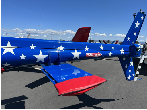
Bell 505 Horizontal Stabilizer Tip Pads

Designed to prevent damage to the aircraft extremities in crowded hangars, these products are made of bright red Naugahyde and thickly padded with a sandwich of closed cell foam.