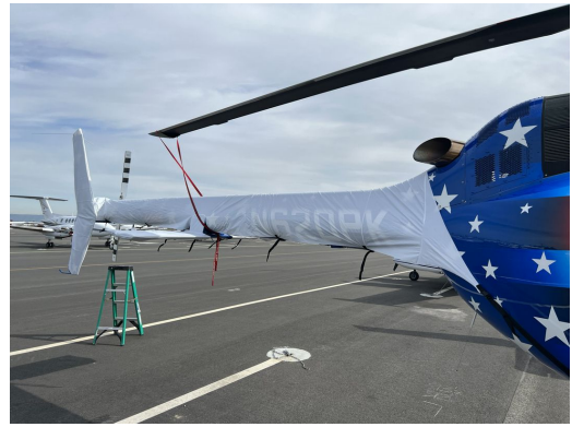
Bell 505 Tailboom & Stabilizer Covers, test fit cover