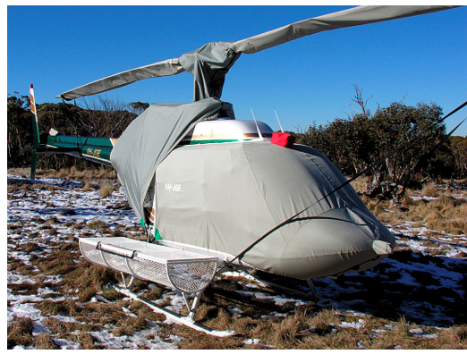
JetRanger Bubble, Engine, Rotor Hub & Blade Covers (& Tie-Downs)