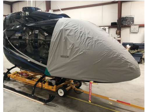
Bell 505 Bubble Cover, travel weight type