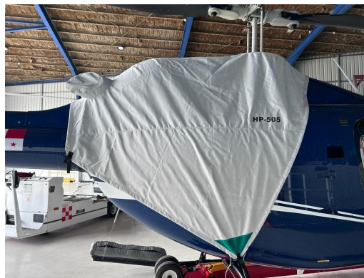
Bell 505 Engine Cover