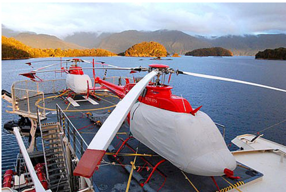
Bell 407 Bubble Cover

Travel Covers are made with Silver Solution-Dyed Polyester fabric and fully lined over the entire cover. The material is lightweight and more compact for easy storage in the aircraft. The polyester material is water resistant, but only intended for occasional use outside. We also have an ultra lightweight material available for fitted hangar dust covers. For daily outdoor use, the non-travel Sunbrella Cover is the best choice.