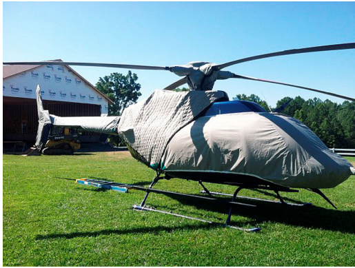
Bell 407 Covers: Bubble, Insulated Engine, Rotor Mast, Blades, Tailboom, Vertical Stabilizer and Tail Rotor

The Engine Inlet Plugs are custom fit for your Bell 505 Jet Ranger X intakes, made with heavy-duty vinyl material, and stuffed with a single block of sculpted urethane foam. Each plug has a zipper that allows the foam to be removed and dried if necessary. Engine plugs have 'Remove Before Flight' streamers sewn onto the face of the plugs. Most plugs are imprinted with the aircraft registration number in black for an extra charge. Storage bag NOT included. Engine plugs may be inserted after flight when the engine is still warm. Engine Inlet Plugs are commonly referred to as Cowl Plugs, Intake Plugs, Cowl Blocks, Engine Blocks, and Engine Bungs.