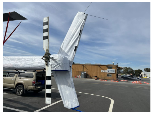
Bell 505 Tailboom & Stabilizer Covers, test fit cover