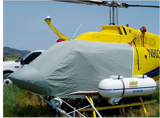
206B Bubble Cover