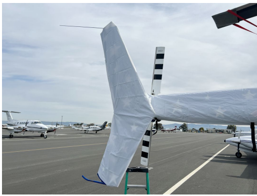
Bell 505 Tailboom & Stabilizer Covers, test fit cover