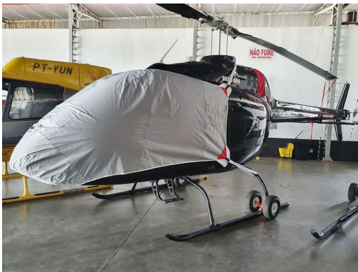
Bell 505 Travel Weight Bubble Cover

Travel Covers are made with Silver Solution-Dyed Polyester fabric and fully lined over the entire cover. The material is lightweight and more compact for easy storage in the aircraft. The polyester material is water resistant, but only intended for occasional use outside. We also have an ultra lightweight material available for fitted hangar dust covers. For daily outdoor use, the non-travel Sunbrella Cover is the best choice.