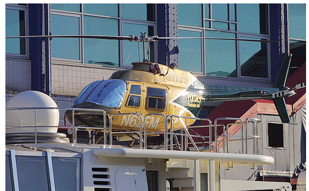
Bell 206B Jetranger Windshield HeatShields