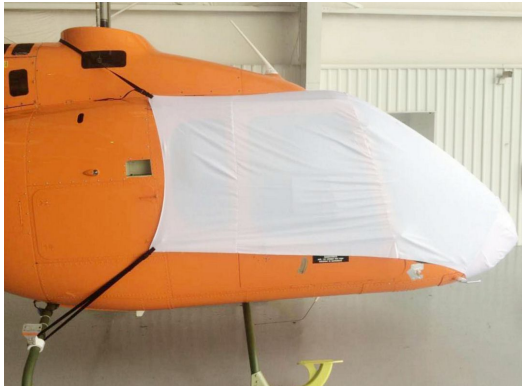
Bell 505 Bubble Cover, test fit cover.

Travel Covers are made with Silver Solution-Dyed Polyester fabric and fully lined over the entire cover. The material is lightweight and more compact for easy storage in the aircraft. The polyester material is water resistant, but only intended for occasional use outside. We also have an ultra lightweight material available for fitted hangar dust covers. For daily outdoor use, the non-travel Sunbrella Cover is the best choice.