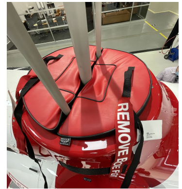
Bell 505 Swash Plate Plug