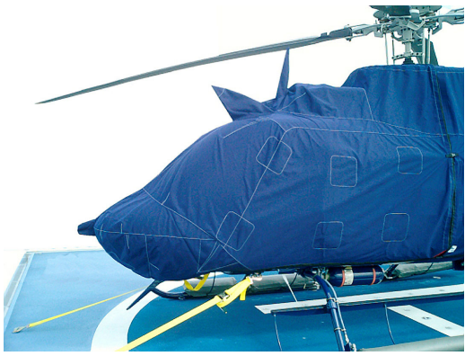
206B/206L/407 Full Body Cover