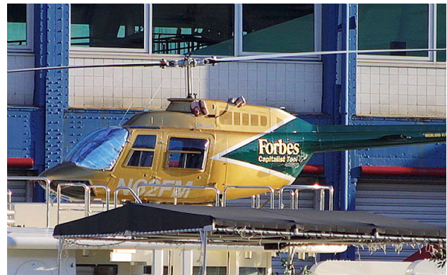
Bell 206B Jetranger Windshield HeatShields