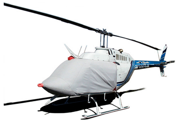
JetRanger Bubble Cover