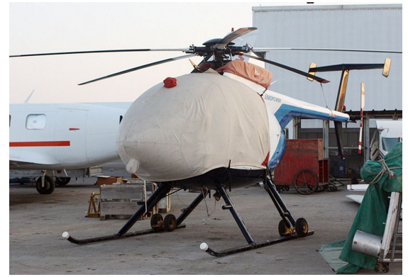
MD-500E Bubble Cover