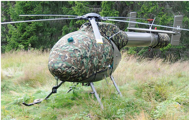
MD520 NOTAR Bubble, Engine, & NOTAR Covers & Blade Tie-downs

Travel Covers are made with Silver Solution-Dyed Polyester fabric and fully lined over the entire cover. The material is lightweight and more compact for easy stowage in the aircraft. The polyester material is water resistant, but only intended for occasional use outside. We also have an ultra lightweight material available for fitted hangar dust covers. For daily outdoor use, the non-travel Sunbrella Cover is the best choice.