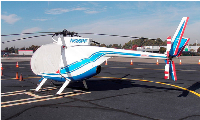
MD500C Bubble Cover with Wire Strike detail