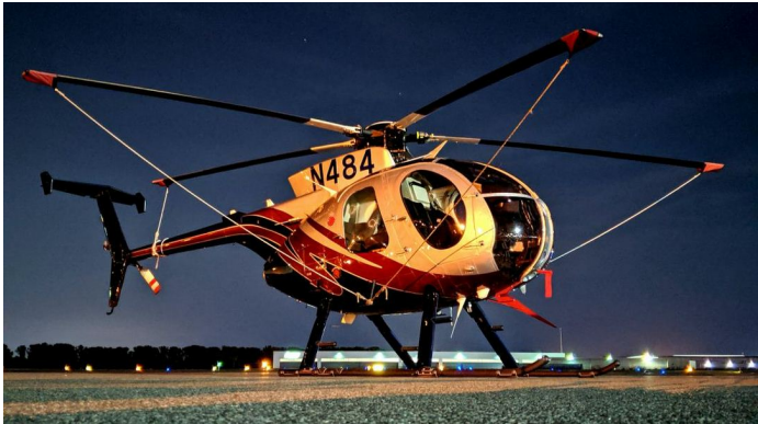
Hughes 500D Blade Tie-Downs