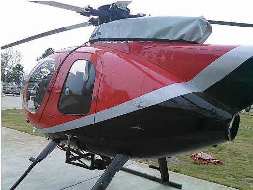
Customized Engine Cover

WINTER USE MATERIAL - Made with Solution-Dyed Polyester fabric, this option is intended for seasonal use to aid in deicing, rain mitigation, or for occasional travel. The material is lighter and more compact, but more susceptible to UV damage and may have a shorter useful life if used continuously outside than the all-year use material.