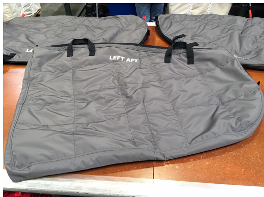
Protective Door Bags

**Padded Door Bags* are designed to provide portable protection of the doors when they are removed from the aircraft. They are padded to moderate thickness, zippered closed, and have sturdy carry handles for easy transport.