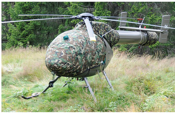
MD520 NOTAR Bubble, Engine, & NOTAR Covers & Blade Tie-downs