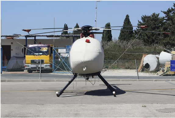
MD-500E Bubble Cover, Blade Tie-Downs

WINTER USE MATERIAL - Made with Solution-Dyed Polyester fabric, this option is intended for seasonal use to aid in deicing, rain mitigation, or for occasional travel. The material is lighter and more compact, but more susceptible to UV damage and may have a shorter useful life if used continuously outside than the all-year use material.