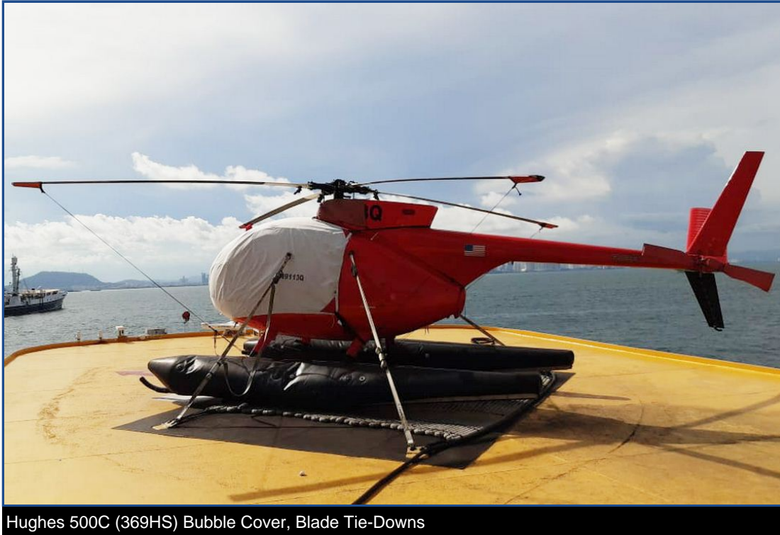
Hughes 500C (369HS) Bubble Cover, Blade Tie-Downs