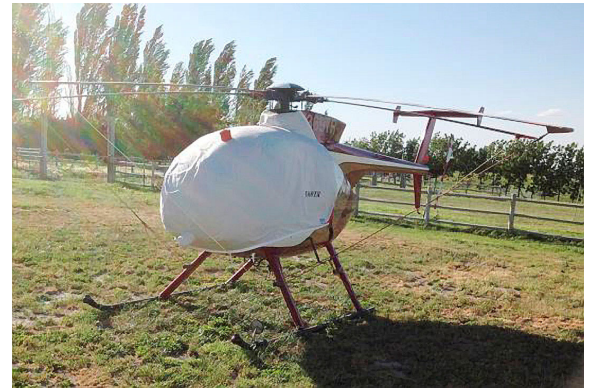
MD500D Bubble Cover with Intake Add-On