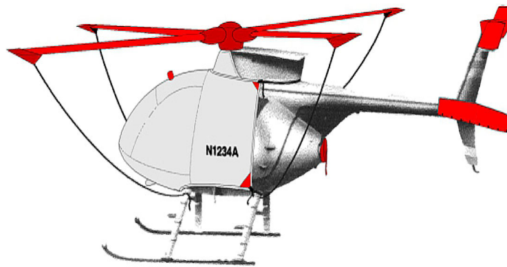
Full Cover Set

The Tailboom Cover details vary by model, but generally the helicopter tail boom cover encloses the tail boom from the "bottleneck" to the aft end. They usually also cover the horizontal stabilizers, and are custom made to allow for antennae, lights, and other protrusions. They attach with straps underneath the tail boom. Covers for the vertical and horizontal stabilizers are also available separately. Specific information for each model is available on request.