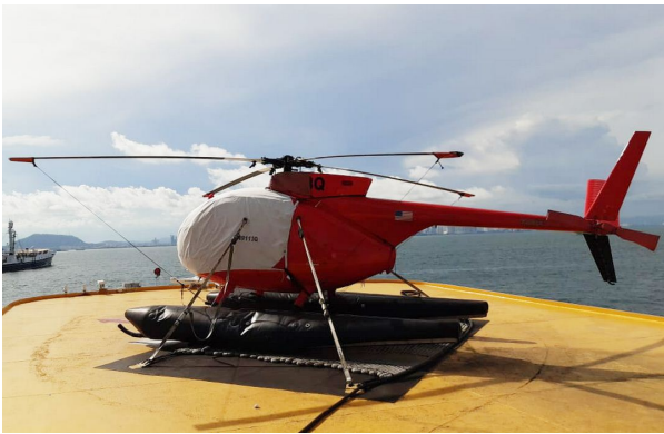
Hughes 500C (369HS) Bubble Cover, Blade Tie-Downs

WINTER USE MATERIAL - Made with Solution-Dyed Polyester fabric, this option is intended for seasonal use to aid in deicing, rain mitigation, or for occasional travel. The material is lighter and more compact, but more susceptible to UV damage and may have a shorter useful life if used continuously outside than the all-year use material.