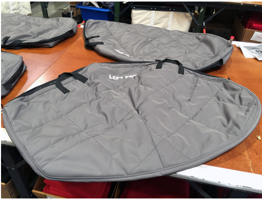
Protective Door Bags