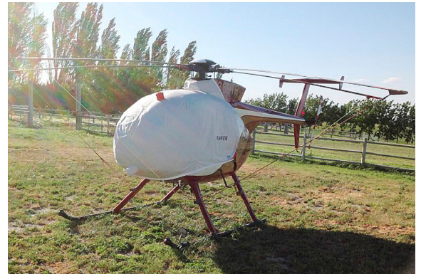
MD500D Bubble Cover with Intake Add-On