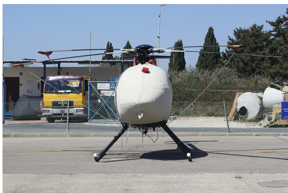
MD-500E Bubble Cover, Blade Tie-Downs

WINTER USE MATERIAL - Made with Solution-Dyed Polyester fabric, this option is intended for seasonal use to aid in deicing, rain mitigation, or for occasional travel. The material is lighter and more compact, but more susceptible to UV damage and may have a shorter useful life if used continuously outside than the all-year use material.