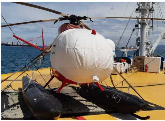
Hughes 500C (369HS) Bubble Cover