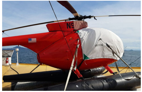
Hughes 500C (369HS) Bubble Cover