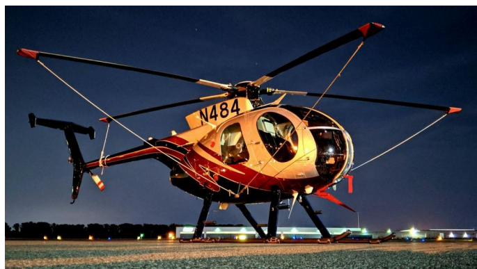
Hughes 500D Blade Tie-Downs