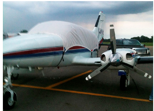
Cessna 401B Canopy Cover