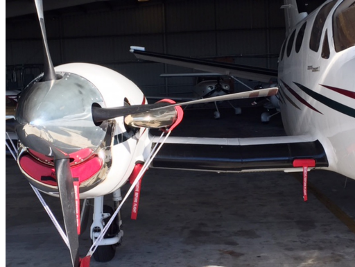
Cessna Conquest I Prop Tie/Exhaust Covers, Engine Plugs