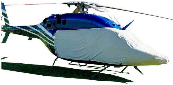
Bell 429 Bubble Cover