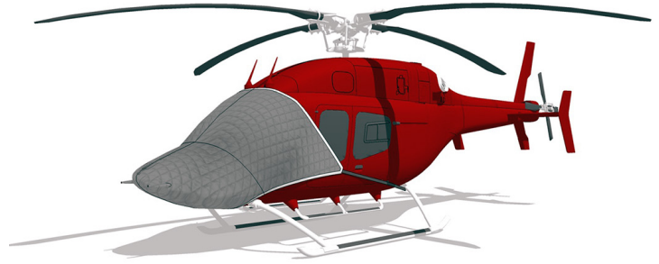
Bell 429 Insulated Cockpit/Nose Cover