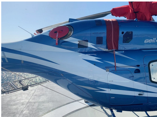
Bell 429 Exhaust Plug, Rotor Mast Cover

WINTER USE MATERIAL - Made with Solution-Dyed Polyester fabric, this option is intended for seasonal use to aid in deicing, rain mitigation, or for occasional travel. The material is lighter and more compact, but more susceptible to UV damage and may have a shorter useful life if used continuously outside than the all-year use material.