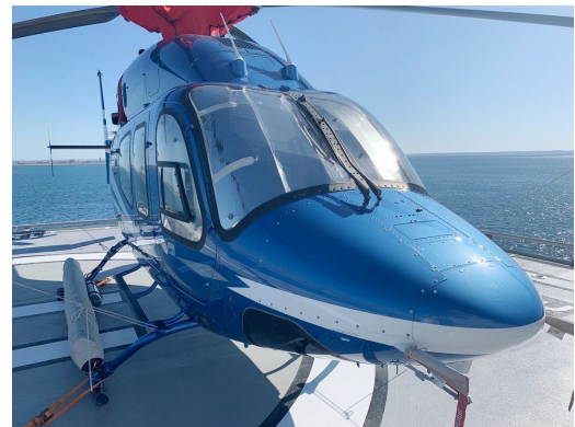
Bell 429 Cockpit HeatShields