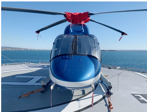
Bell 429 Windshield HeatShields, Rotor Mast Cover

Cockpit Heatshields are interior sunshades for the aircraft's cockpit. The product is a unique composite of closed-cell foam with a silver mylar finish. The semi-rigid design is stiff enough to stand inside the window framing. Darts and folds are incorporated into the material so that it conforms to the complex shape of the helicopter windows. The set folds up flat and is easily stored in the included storage sleeve. Some designs may require velcro and suction cups. A Heatshield is an excellent short-term remedy for cockpit overheating, but an external fabric cover is more effective for long-term protection.