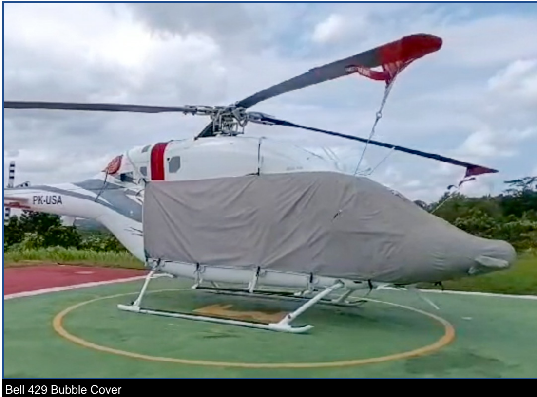
Bell 429 Bubble Cover