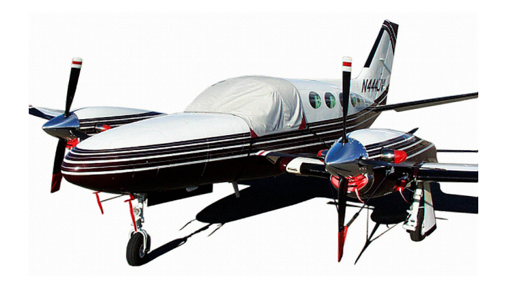
Cessna 425 Cockpit Cover