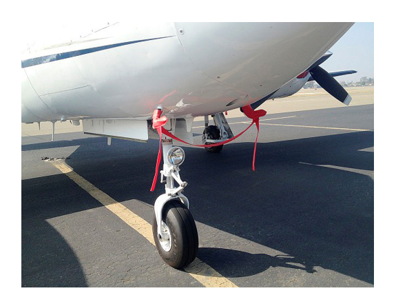
Cessna 421 Pltot Covers set