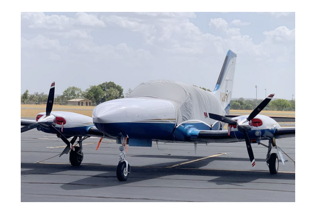
Cessna 414 Travel Weight Canopy Cover, Engine Plugs

Travel Covers are made with Silver Solution-Dyed Polyester fabric and only lined over the windshield to save weight. The material is lightweight and more compact for easy stowage in the aircraft. The polyester material is water resistant, but only intended for occasional use outside. We also have an ultra lightweight material available for fitted hangar dust covers. For daily outdoor use, the non-travel Sunbrella Cover is the best choice.