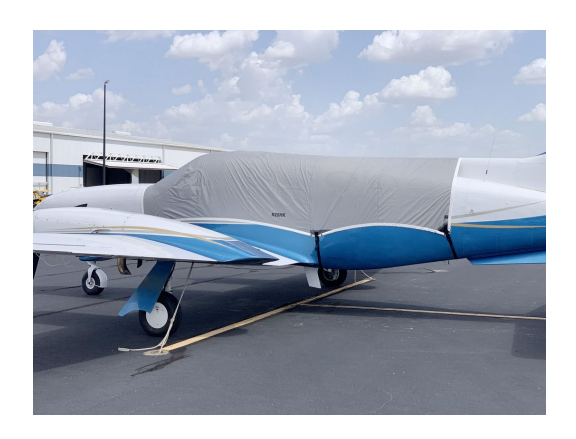
Cessna 414 Travel Weight Canopy Cover