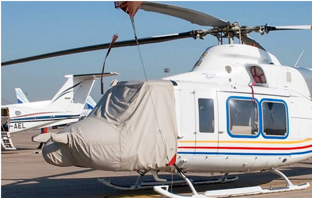
Bell 412 Cockpit/Canopy/Nose Cover, w/Radome

Canopy/Nose Covers enclose the entire canopy including the windshield, skylights, and chin bubble. Attachment buckles are made of nonmetal Delrin , designed for rugged outdoor use. Both the top and bottom hems of the cover have a special rope-hem feature with which they can be tightened to help prevent abrasive chafing of the windshield. Pockets are sewn into the cover for the temperature probe and pitot tubes. The bubble cover is reinforced with patches at hinge points, door handles, and for the windshield wipers. For ease of installation, the bubble cover is color-coded (red=left, green=right) with color swatches sewn into the corners. This cover type is made from Silver Acrylic Sunbrella canvas and is 100% lined with a soft and smooth microfiber. Bruce's Custom Covers developed this material combination especially for aircraft protection. The outer material is medium weight and treated for water resistance, UV resistance and anti-static buildup. The inner lining is a very soft and smooth microfiber to prevent scratching. The material is very reflective, and tests show that the cabin interior temperature can be reduced to near-ambient temperature on the hottest of days. It is water, ice and snow repellent, yet breathable to allow moisture to escape from between the cover and the aircraft surface.