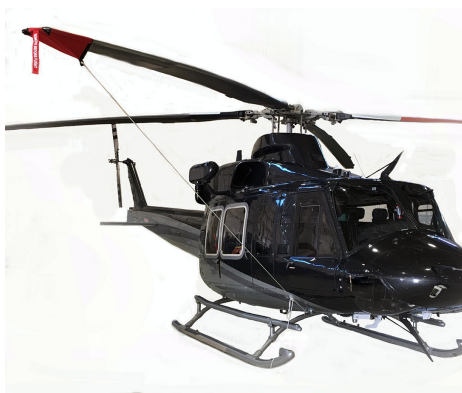
BLADE TIE DOWNS

WINTER USE MATERIAL - Made with Solution-Dyed Polyester fabric, this option is intended for seasonal use to aid in deicing, rain mitigation, or for occasional travel. The material is lighter and more compact, but more susceptible to UV damage and may have a shorter useful life if used continuously outside than the all-year use material.