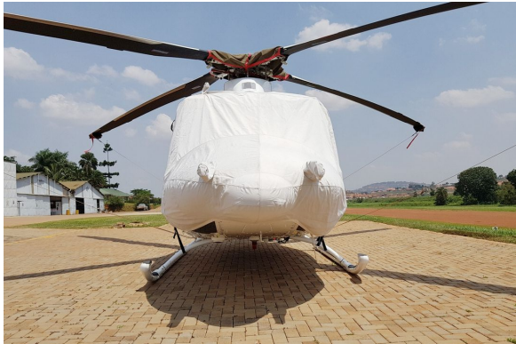
Bell 412 Cockpit/Canopy/Nose Cover