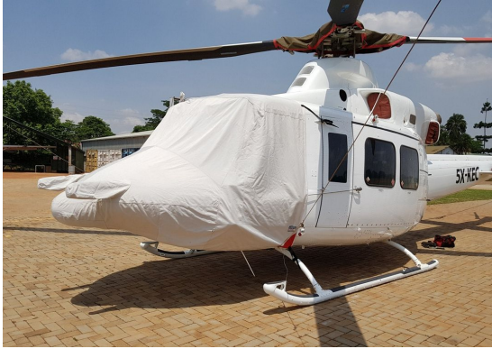
Bell 412 Cockpit/Canopy/Nose Cover

Canopy/Nose Covers enclose the entire canopy including the windshield, skylights, and chin bubble. Attachment buckles are made of nonmetal Delrin , designed for rugged outdoor use. Both the top and bottom hems of the cover have a special rope-hem feature with which they can be tightened to help prevent abrasive chafing of the windshield. Pockets are sewn into the cover for the temperature probe and pitot tubes. The bubble cover is reinforced with patches at hinge points, door handles, and for the windshield wipers. For ease of installation, the bubble cover is color-coded (red=left, green=right) with color swatches sewn into the corners. This cover type is made from Silver Acrylic Sunbrella canvas and is 100% lined with a soft and smooth microfiber. Bruce's Custom Covers developed this material combination especially for aircraft protection. The outer material is medium weight and treated for water resistance, UV resistance and anti-static buildup. The inner lining is a very soft and smooth microfiber to prevent scratching. The material is very reflective, and tests show that the cabin interior temperature can be reduced to near-ambient temperature on the hottest of days. It is water, ice and snow repellent, yet breathable to allow moisture to escape from between the cover and the aircraft surface.