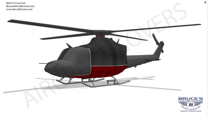
Bell 412 Forward Cabin/Nose, Insulated Engine, Tailboom, Rotor Hub & Blade Covers