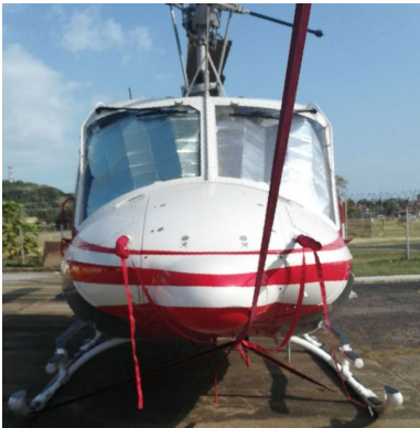
Bell 212 Windshield HeatShields