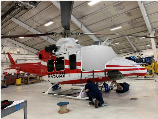
Bell 412 Cockpit/Canopy Cover, photo/illustration

Travel Covers are made with Silver Solution-Dyed Polyester fabric and fully lined over the entire cover. The material is lightweight and more compact for easy stowage in the aircraft. The polyester material is water resistant, but only intended for occasional use outside. We also have an ultra lightweight material available for fitted hangar dust covers. For daily outdoor use, the non-travel Sunbrella Cover is the best choice.