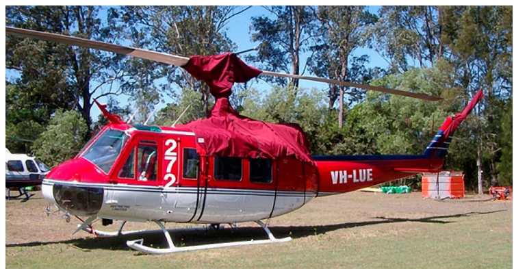
Bell 204/205 Engine/Mid-Cabin Cover, Main & Tail Rotor Covers