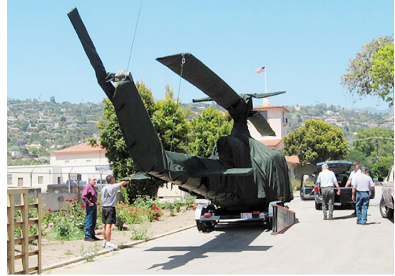
Bell 204/205 Full Body Cover Set