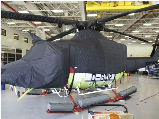
Bell 412 Cockpit/Canopy/Nose, Insulated Engine Area, Rotor Hub, Blade, Tailboom and Tail Rotor Covers