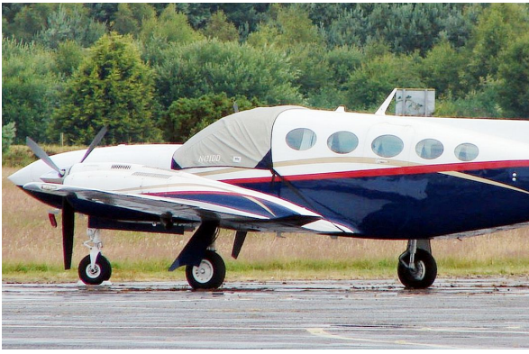
Cessna 421 Cockpit Cover