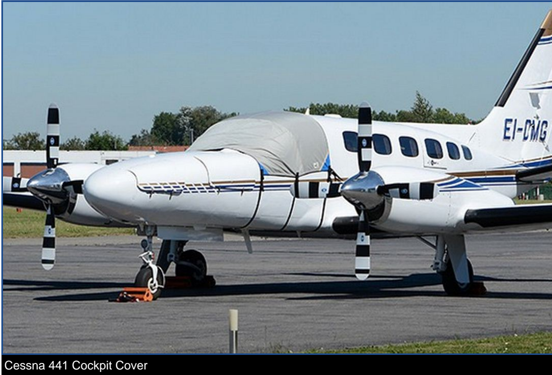
Cessna 441 Cockpit Cover