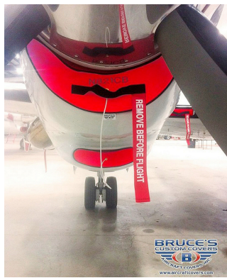
Engine and Oil Cooler Inlet Plugs