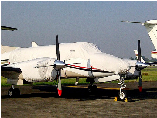
King Air 350 Canopy/Nose Cover, Engine Covers

The material is very reflective, and tests show that the cabin interior temperature can be reduced to near-ambient temperature on the hottest of days. It is water, ice and snow repellent, yet breathable to allow moisture to escape from between the cover and the aircraft surface.