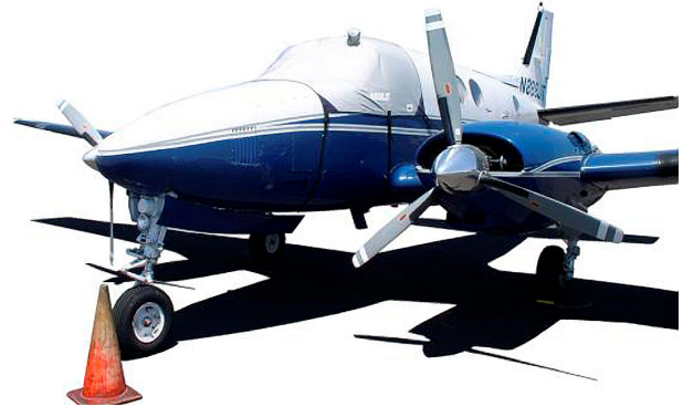
King Air Cockpit Cover, belly-strap type