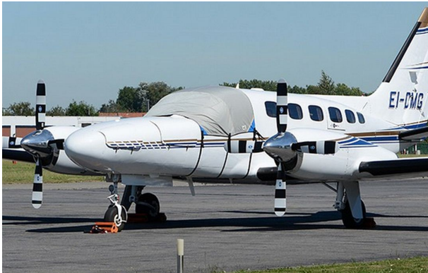
Cessna 441 Cockpit Cover

This cover type is made from Silver Acrylic Sunbrella canvas and is 100% lined with a soft and smooth microfiber. Bruce's Custom Covers developed this material combination especially for aircraft protection. The outer material is medium weight and treated for water resistance, UV resistance and anti-static buildup. The inner lining is a very soft and smooth microfiber to prevent scratching. The material is very reflective, and tests show that the cabin interior temperature can be reduced to near-ambient temperature on the hottest of days. It is water, ice and snow repellent, yet breathable to allow moisture to escape from between the cover and the aircraft surface.