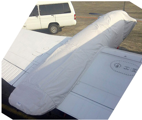
King Air 350 Engine Cover