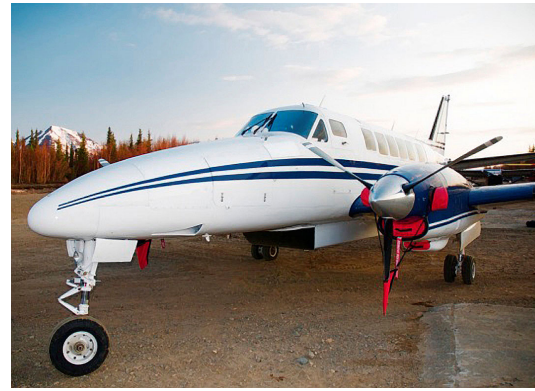
Beech 99 Engine Plugs & Prop Ties