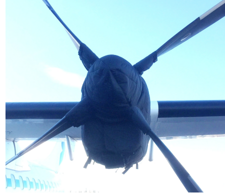
ATR-72-202 Insulated Engine & Prop Hub Covers