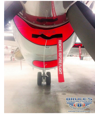
Engine and Oil Cooler Inlet Plugs