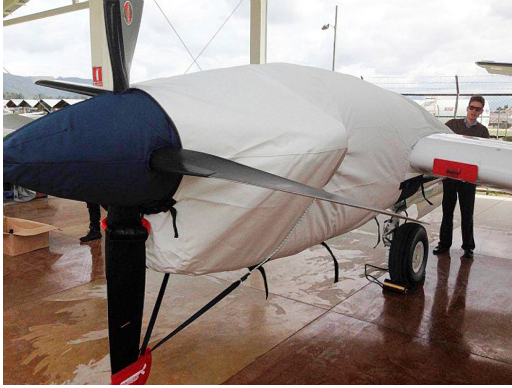
King Air C90 Engine Cover

The material is very reflective, and tests show that the cabin interior temperature can be reduced to near-ambient temperature on the hottest of days. It is water, ice and snow repellent, yet breathable to allow moisture to escape from between the cover and the aircraft surface.