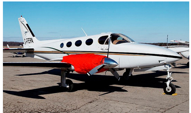
Cessna 340 Insulated Engine Covers