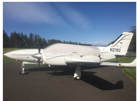
Cessna 421C Canopy Cover