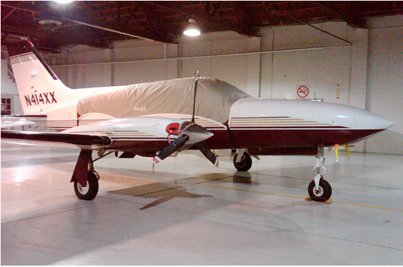
Cessna 414 Canopy Cover and Engine Inlet Plugs

non-travel Sunbrella Cover is the best choice.