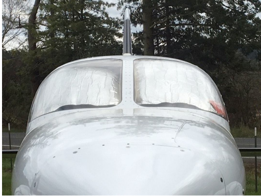
Cessna 421 Windshield HeatShields

foam with a silver mylar finish. The semi-rigid design is stiff enough to stand along the inside of the windshield using sun visors or window framing. It folds up flat and easily stores in the included storage sleeve. Some designs may require velcro and suction cups. A Heatshield is an excellent short-term remedy for cockpit overheating.