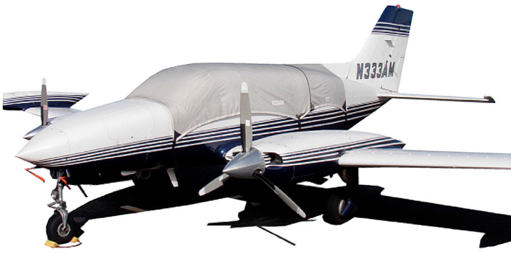
Cessna 414 Canopy Cover & Pitot Covers

occasional use outside. We also have an ultra lightweight material available for fitted hangar dust covers. For daily outdoor use, the non-travel Sunbrella Cover is the best choice.