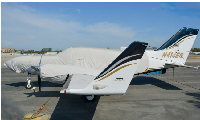
Cessna 414A Extended Canopy/Nose Cover & Engine Covers

This cover type is made from Silver Acrylic Sunbrella canvas and is 100% lined with a soft and smooth microfiber. Bruce's Custom Covers developed this material combination especially for aircraft protection. The outer material is medium weight and treated for water resistance, UV resistance and anti-static buildup. The inner lining is a very soft and smooth microfiber to prevent scratching. The material is very reflective, and tests show that the cabin interior temperature can be reduced to near-ambient temperature on the hottest of days. It is water, ice and snow repellent, yet breathable to allow moisture to escape from between the cover and the aircraft surface.