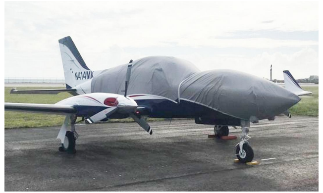
Cessna 414 Travel Cover, Light Weight Canopy Cover