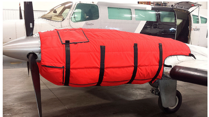
Cessna 404 Insulated Engine Cover