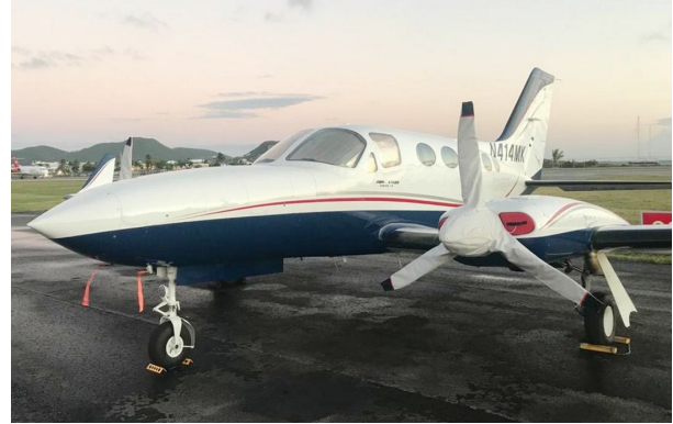
Cessna 414 Propellor/Spinner Covers, 3 Blade