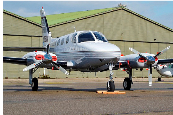
Cessna 340 Engine Plugs