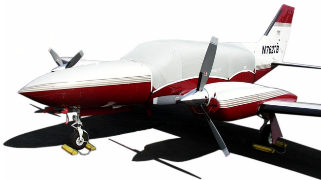
Cessna 421C Canopy Cover & Engine Plugs

This cover type is made from Silver Acrylic Sunbrella canvas and is 100% lined with a soft and smooth microfiber. Bruce's Custom Covers developed this material combination especially for aircraft protection. The outer material is medium weight and treated for water resistance, UV resistance and anti-static buildup. The inner lining is a very soft and smooth microfiber to prevent scratching. The material is very reflective, and tests show that the cabin interior temperature can be reduced to near-ambient temperature on the hottest of days. It is water, ice and snow repellent, yet breathable to allow moisture to escape from between the cover and the aircraft surface.