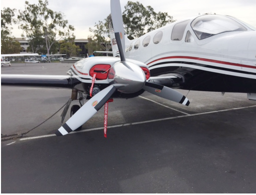
Cessna 414 Engine Inlet Plugs

Engine Inlet Plugs are custom fit for your Cessna 404 Titan, F406 Caravan II intakes, made with heavy-duty vinyl material, and stuffed with a single block of sculpted urethane foam. Each plug has a zipper that allows the foam to be removed and dried if necessary. Engine plugs have warning flags that are visible from the cockpit or 'remove before flight' streamers sewn onto the face of the plugs. Most plugs are imprinted with the aircraft registration number in black for an extra charge. Storage bag NOT included. Engine plugs may be inserted after flight when the engine is still warm. Engine Inlet Plugs are commonly referred to as Cowl Plugs, Intake Plugs, Cowl Blocks, Engine Blocks, and Engine Bungs.