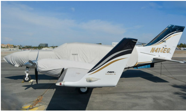
Cessna 414A Extended Canopy/Nose Cover & Engine Covers