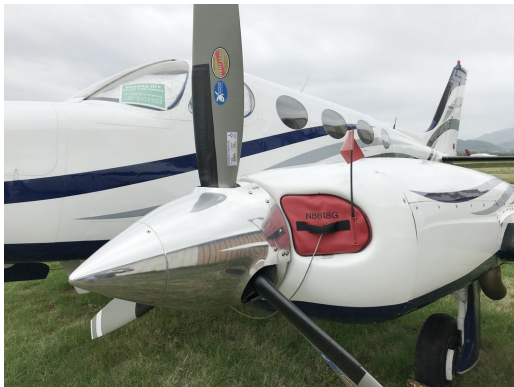
Cessna 340 Engine Inlet Plugs

Engine Inlet Plugs are custom fit for your Cessna 401 intakes, made with heavy-duty vinyl material, and stuffed with a single block of sculpted urethane foam. Each plug has a zipper that allows the foam to be removed and dried if necessary. Engine plugs have warning flags that are visible from the cockpit or 'remove before flight' streamers sewn onto the face of the plugs. Most plugs are imprinted with the aircraft registration number in black for an extra charge. Storage bag NOT included. Engine plugs may be inserted after flight when the engine is still warm. Engine Inlet Plugs are commonly referred to as Cowl Plugs, Intake Plugs, Cowl Blocks, Engine Blocks, and Engine Bungs.