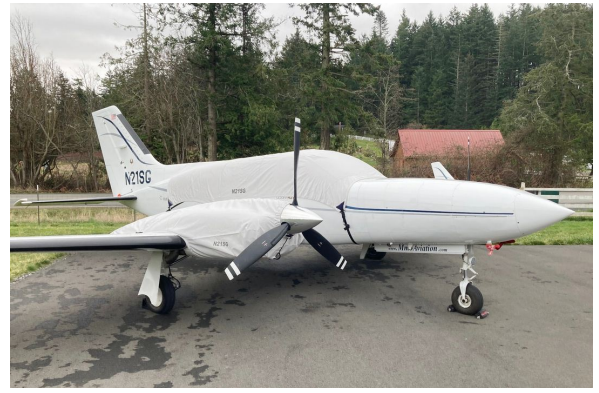
Cessna 421C Canopy & Engine Covers