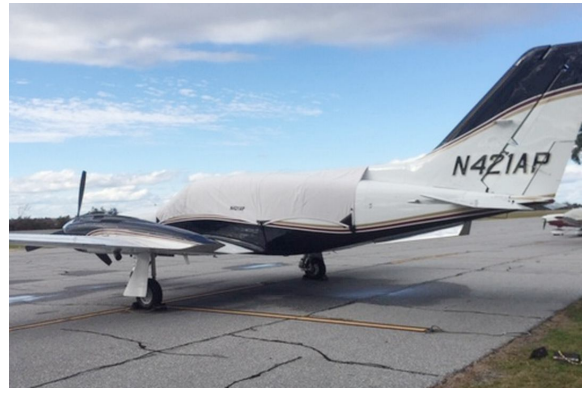
Cessna 421 Canopy Cover