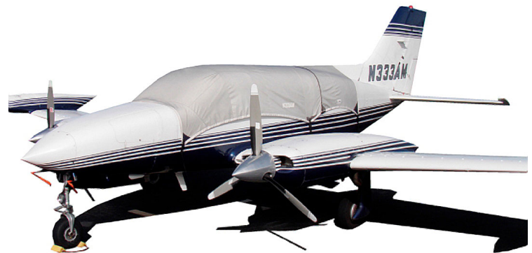
Cessna 414 Canopy Cover & Pitot Covers