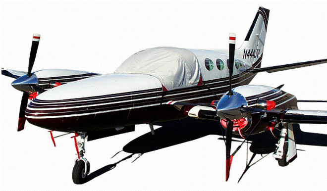
Cessna 425 Cockpit Cover

Travel Covers are made with Silver Solution-Dyed Polyester fabric and only lined over the windshield to save weight. The material is lightweight and more compact for easy stowage in the aircraft. The polyester material is water resistant, but only intended for occasional use outside. We also have an ultra lightweight material available for fitted hangar dust covers. For daily outdoor use, the non-travel Sunbrella Cover is the best choice.