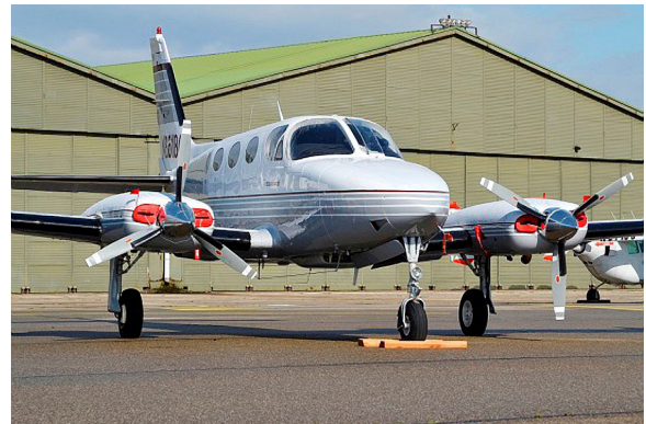
Cessna 340 Engine Plugs