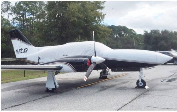
Cessna 421 Canopy Cover, Engine Plugs