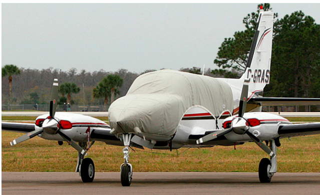
Cessna 340 Canopy/Nose Cover & Engine Inlet Plugs

Travel Covers are made with Silver Solution-Dyed Polyester fabric and only lined over the windshield to save weight. The material is lightweight and more compact for easy stowage in the aircraft. The polyester material is water resistant, but only intended for occasional use outside. We also have an ultra lightweight material available for fitted hangar dust covers. For daily outdoor use, the non-travel Sunbrella Cover is the best choice.