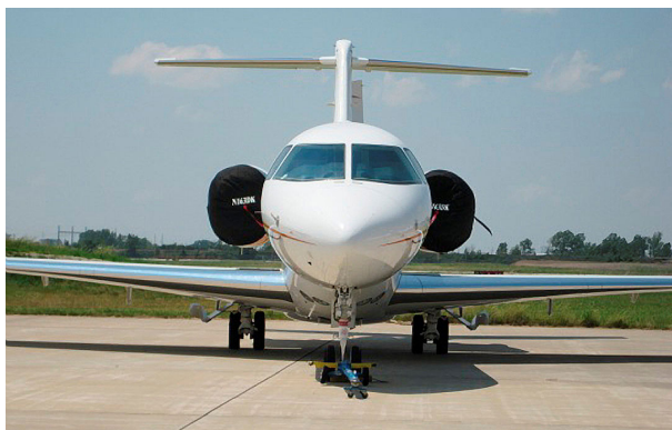
Hawker 4000 Intake Covers

The Hawker Beechcraft 4000 Horizon Intake Covers are designed to install easily yet be completely storable. A spring steel hoop is sewn into the hem of each cover, allowing them to be installed without climbing onto the wing or using a stepladder. To store the covers the spring steel hoop folds like a band-saw blade into three nesting rings. Each cover folds into a compact circular bundle which is stored in the included duffle bag, yet they unfold quickly for use. The Tri-Fold Ring cover is made of medium weight nylon which is available in a variety of colors to match the paint trim. Each cover set comes complete with installation and folding instructions. The aircraft's registration number can be silkscreened onto the cover for an extra charge.