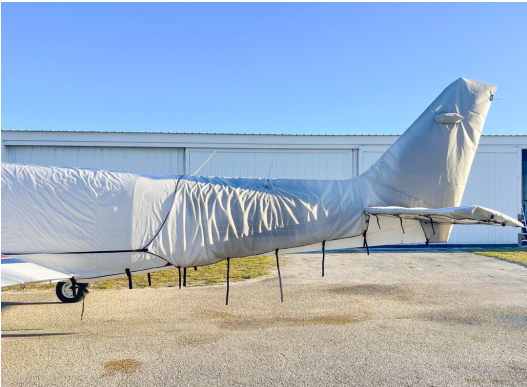
Cessna 335, 340 Empennage Cover (Tailboom, Vertical & Horiz Stabilizers), All Year Use