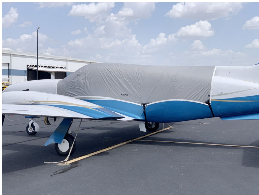
Cessna 414 Travel Weight Canopy Cover