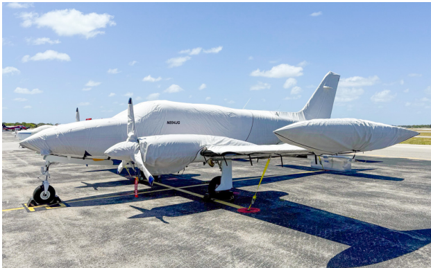
Cessna 340 Complete Cover Set

This cover type is made from Silver Acrylic Sunbrella canvas and is 100% lined with a soft and smooth microfiber. Bruce's Custom Covers developed this material combination especially for aircraft protection. The outer material is medium weight and treated for water resistance, UV resistance and anti-static buildup. The inner lining is a very soft and smooth microfiber to prevent scratching. The material is very reflective, and tests show that the cabin interior temperature can be reduced to near-ambient temperature on the hottest of days. It is water, ice and snow repellent, yet breathable to allow moisture to escape from between the cover and the aircraft surface.