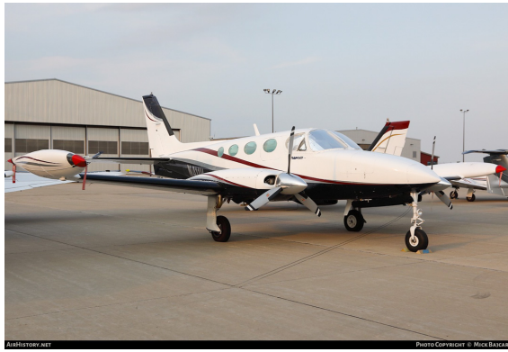
Cessna 340 Wingtip Pads