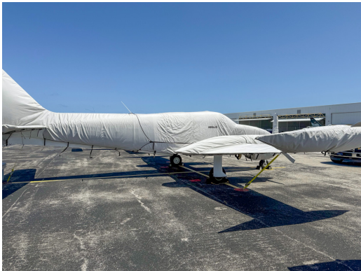
Cessna 340 Complete Cover Set