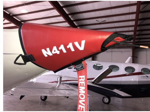
Cessna 335, 340 Wingtip Pads