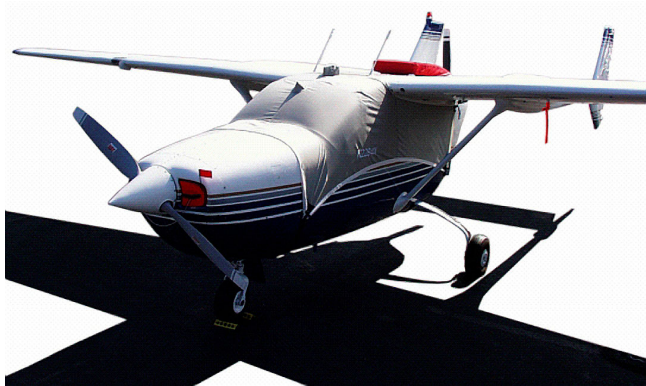
Cessna Skymaster Canopy Cover with Forward Extension, Fwd. Engine Plugs, Aft Engine Cover

This cover type is made from Silver Acrylic Sunbrella canvas and is 100% lined with a soft and smooth microfiber. Bruce's Custom Covers developed this material combination especially for aircraft protection. The outer material is medium weight and treated for water resistance, UV resistance and anti-static buildup. The inner lining is a very soft and smooth microfiber to prevent scratching. The material is very reflective, and tests show that the cabin interior temperature can be reduced to near-ambient temperature on the hottest of days. It is water, ice and snow repellent, yet breathable to allow moisture to escape from between the cover and the aircraft surface.