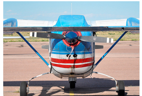
Cessna 337 Skymaster Aft Engine Inlet Plugs