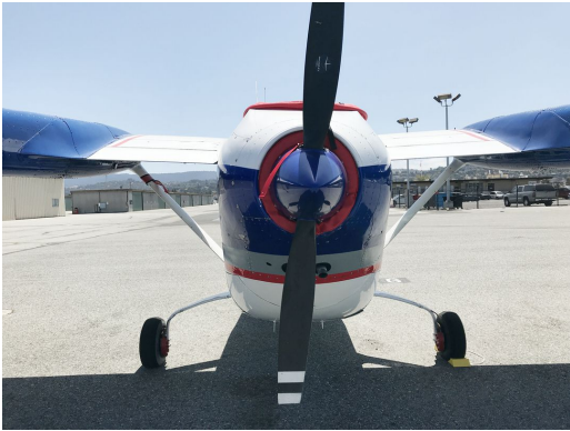
Cessna 337 Skymaster Rear Engine Plugs, Rear Engine Inlet Cover (SOLD SEPARATELY)