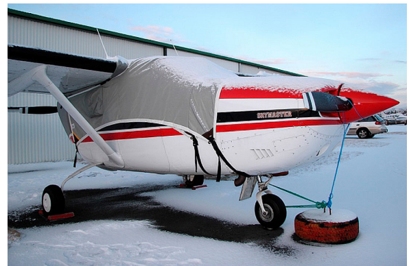
Cessna 337 Skymaster Canopy Cover w/ 14" bib ext., goes back to rear engine inlet and hooks to t.e.