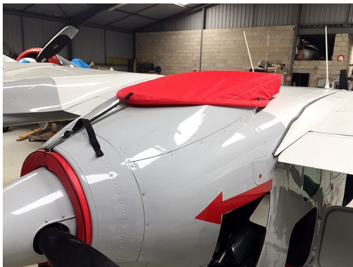
Cessna 337 Skymaster Aft Engine Inlet Cover, hoop type, & outlet plugs (SOLD SEPARATELY)

Engine Inlet Plugs are custom fit for your Cessna 336 (Fixed Gear Skymaster) intakes, made with heavy-duty vinyl material, and stuffed with a single block of sculpted urethane foam. Each plug has a zipper that allows the foam to be removed and dried if necessary. Engine plugs have warning flags that are visible from the cockpit or 'remove before flight' streamers sewn onto the face of the plugs. Most plugs are imprinted with the aircraft registration number in black for an extra charge. Storage bag NOT included. Engine plugs may be inserted after flight when the engine is still warm. Engine Inlet Plugs are commonly referred to as Cowl Plugs, Intake Plugs, Cowl Blocks, Engine Blocks, and Engine Bungs.