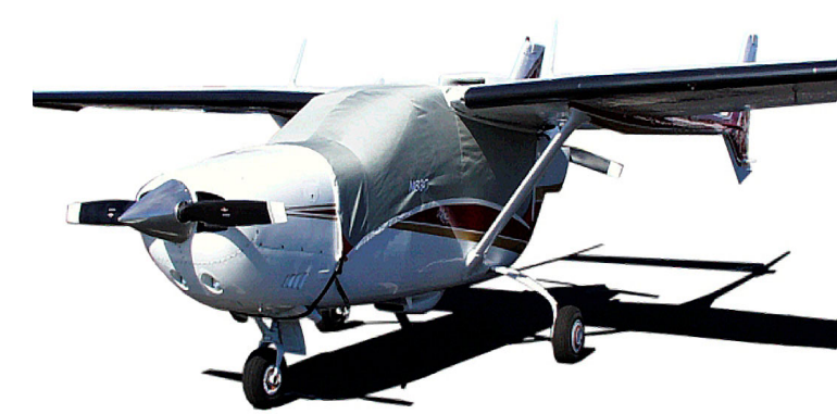
Cessna Skymaster Canopy Cover w/ 14" bib ext.

This cover type is made from Silver Acrylic Sunbrella canvas and is 100% lined with a soft and smooth microfiber. Bruce's Custom Covers developed this material combination especially for aircraft protection. The outer material is medium weight and treated for water resistance, UV resistance and anti-static buildup. The inner lining is a very soft and smooth microfiber to prevent scratching. The material is very reflective, and tests show that the cabin interior temperature can be reduced to near-ambient temperature on the hottest of days. It is water, ice and snow repellent, yet breathable to allow moisture to escape from between the cover and the aircraft surface.