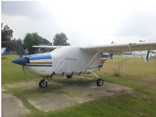
Cessna Sky Master Canopy Cover, extended down to cover door.