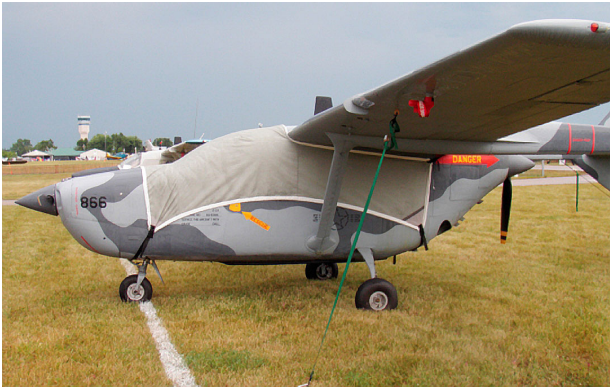
Cessna 337 Skymaster Canopy Cover w/ 14" bib ext. & Pitot Cover Set

This cover type is made from Silver Acrylic Sunbrella canvas and is 100% lined with a soft and smooth microfiber. Bruce's Custom Covers developed this material combination especially for aircraft protection. The outer material is medium weight and treated for water resistance, UV resistance and anti-static buildup. The inner lining is a very soft and smooth microfiber to prevent scratching. The material is very reflective, and tests show that the cabin interior temperature can be reduced to near-ambient temperature on the hottest of days. It is water, ice and snow repellent, yet breathable to allow moisture to escape from between the cover and the aircraft surface.