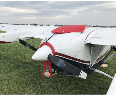
Cessna 337 Skymaster Aft Engine Inlet Cover, Rear Engine Plugs (SOLD SEPARATELY)