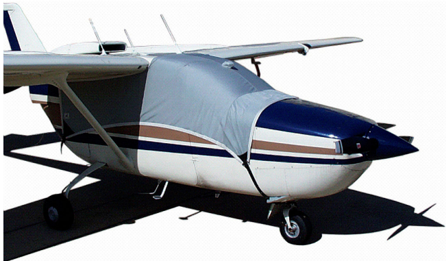
Cessna Skymaster Canopy Cover with Forward Extension