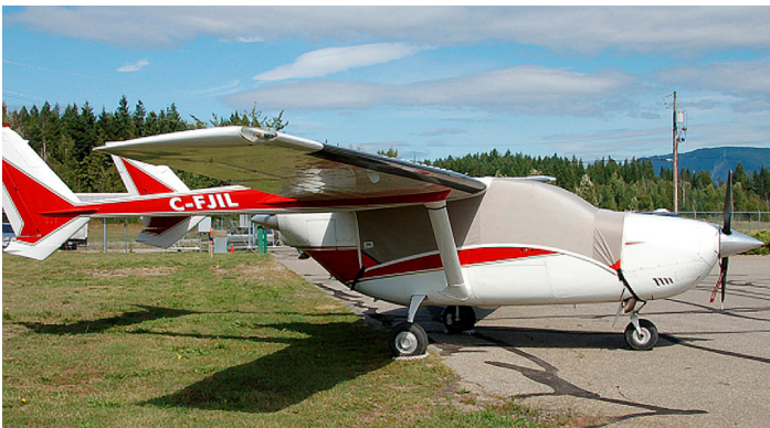
Cessna 337 Skymaster Canopy Cover w/ 14" bib ext.

This cover type is made from Silver Acrylic Sunbrella canvas and is 100% lined with a soft and smooth microfiber. Bruce's Custom Covers developed this material combination especially for aircraft protection. The outer material is medium weight and treated for water resistance, UV resistance and anti-static buildup. The inner lining is a very soft and smooth microfiber to prevent scratching. The material is very reflective, and tests show that the cabin interior temperature can be reduced to near-ambient temperature on the hottest of days. It is water, ice and snow repellent, yet breathable to allow moisture to escape from between the cover and the aircraft surface.