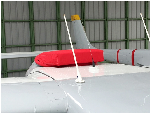
Cessna 337 Skymaster Aft Engine Inlet Cover, hoop type

Engine Inlet Plugs are custom fit for your Cessna 336 (Fixed Gear Skymaster) intakes, made with heavy-duty vinyl material, and stuffed with a single block of sculpted urethane foam. Each plug has a zipper that allows the foam to be removed and dried if necessary. Engine plugs have warning flags that are visible from the cockpit or 'remove before flight' streamers sewn onto the face of the plugs. Most plugs are imprinted with the aircraft registration number in black for an extra charge. Storage bag NOT included. Engine plugs may be inserted after flight when the engine is still warm. Engine Inlet Plugs are commonly referred to as Cowl Plugs, Intake Plugs, Cowl Blocks, Engine Blocks, and Engine Bungs.