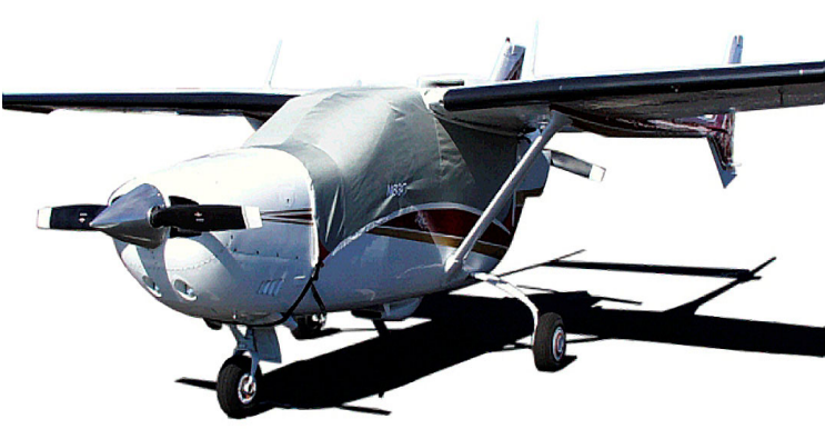
Cessna Skymaster Canopy Cover w/ 14" bib ext.