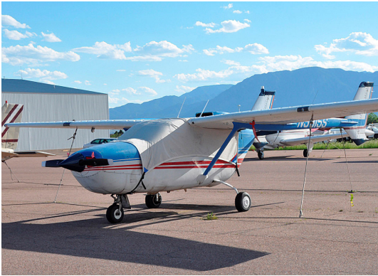
Cessna 337 Skymaster Canopy Cover, Forward Engine Plugs and Pitot Cover