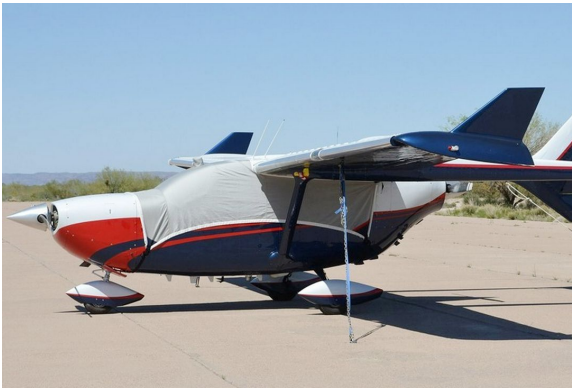
Canopy Cover with Forward Extension

This cover type is made from Silver Acrylic Sunbrella canvas and is 100% lined with a soft and smooth microfiber. Bruce's Custom Covers developed this material combination especially for aircraft protection. The outer material is medium weight and treated for water resistance, UV resistance and anti-static buildup. The inner lining is a very soft and smooth microfiber to prevent scratching. The material is very reflective, and tests show that the cabin interior temperature can be reduced to near-ambient temperature on the hottest of days. It is water, ice and snow repellent, yet breathable to allow moisture to escape from between the cover and the aircraft surface.