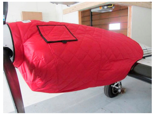
Cessna 421 Insulated Engine Covers