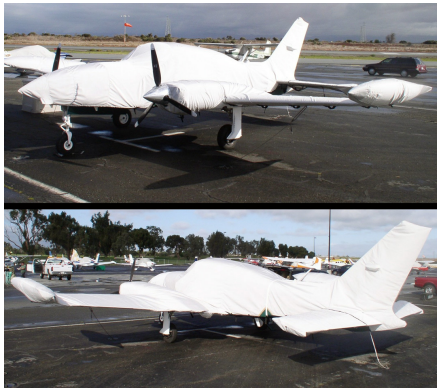
Cessna 310 Complete Cover Set