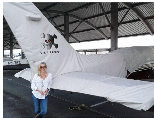
Cessna 310R Empennage Cover