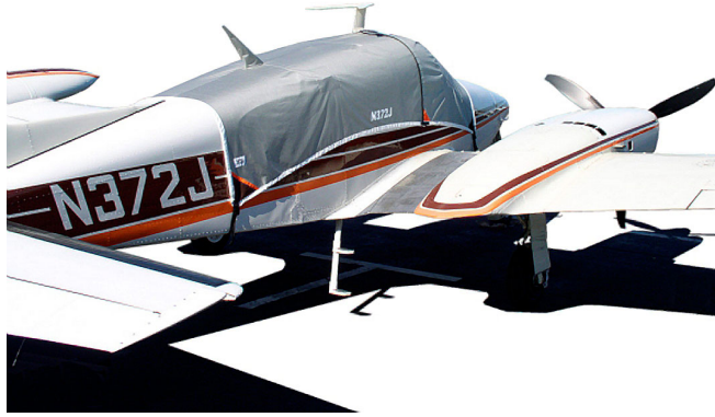
Cessna 320 Canopy Cover

Travel Covers are made with Silver Solution-Dyed Polyester fabric and only lined over the windshield to save weight. The material is lightweight and more compact for easy stowage in the aircraft. The polyester material is water resistant, but only intended for occasional use outside. We also have an ultra lightweight material available for fitted hangar dust covers. For daily outdoor use, the non-travel Sunbrella Cover is the best choice.