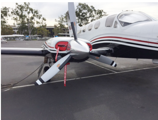
Cessna 414 Engine Inlet Plugs

Engine Inlet Plugs are custom fit for your Cessna 320 intakes, made with heavy-duty vinyl material, and stuffed with a single block of sculpted urethane foam. Each plug has a zipper that allows the foam to be removed and dried if necessary. Engine plugs have warning flags that are visible from the cockpit or 'remove before flight' streamers sewn onto the face of the plugs. Most plugs are imprinted with the aircraft registration number in black for an extra charge. Storage bag NOT included. Engine plugs may be inserted after flight when the engine is still warm. Engine Inlet Plugs are commonly referred to as Cowl Plugs, Intake Plugs, Cowl Blocks, Engine Blocks, and Engine Bungs.