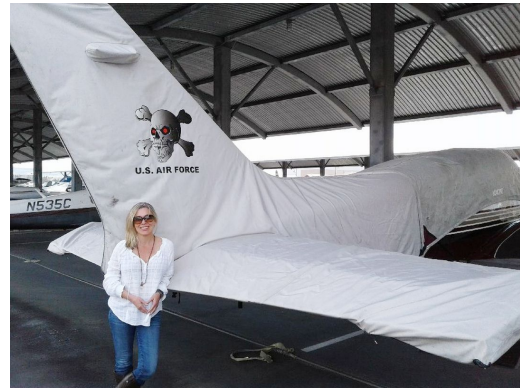
Cessna 310R Empennage Cover