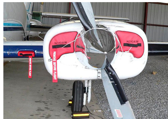
Cessna 310P Engine Inlet and Center Section Inlet Plugs