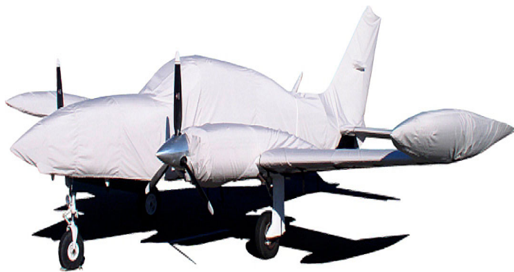
Cessna 310 Complete Cover Set