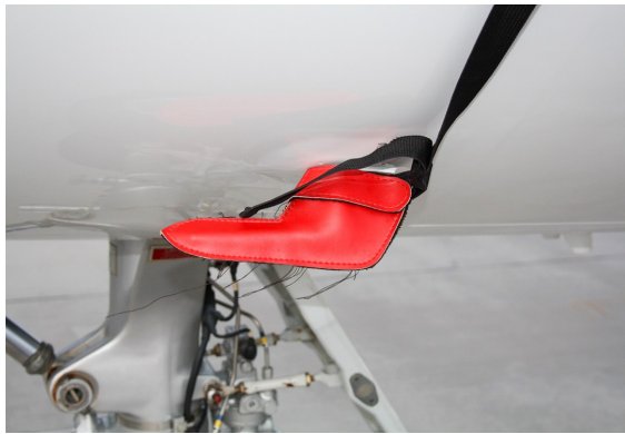
Falcon Jet 2000EX, 2000LXS Pitot Covers, Aoa's, Tat Cover Set, Heat Resistant Type

The Engine Inlet Plugs are custom fit for your Falcon Jet 2000EX, 2000LXS intakes, made with heavy-duty vinyl material, and stuffed with a single block of sculpted urethane foam. Each plug has a zipper that allows the foam to be removed and dried if necessary. Engine plugs have 'remove before flight' streamers sewn onto the face of the plugs. Most plugs are imprinted with the aircraft registration number in black for an extra charge. Storage bag NOT included. Engine plugs may be inserted after flight when the engine is still warm. Engine Inlet Plugs are commonly referred to as Cowl Plugs, Intake Plugs, Cowl Blocks, Engine Blocks, and Engine Bungs.