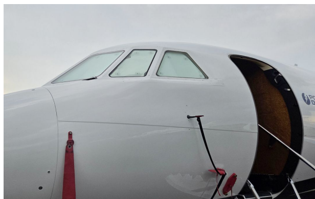
Dassault Aviation FALCON 2000EX Cockpit Heatshields (set of 7) Dassault Aviation FALCON 2000EX Cockpit Heatshields (set of 7)