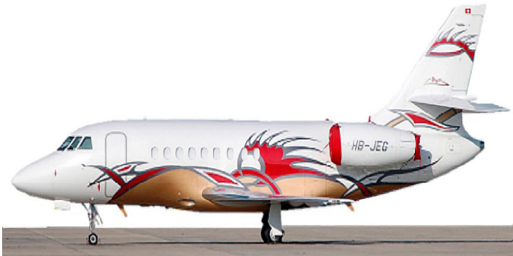
Falcon 2000EX Engine Cover Set, OEM Design