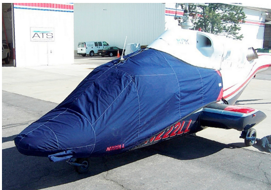
Bell 222 Bubble Cover

This cover type is made from Silver Acrylic Sunbrella canvas and is 100% lined with a soft and smooth microfiber. Bruce's Custom Covers developed this material combination especially for aircraft protection. The outer material is medium weight and treated for water resistance, UV resistance and anti-static buildup. The inner lining is a very soft and smooth microfiber to prevent scratching. The material is very reflective, and tests show that the cabin interior temperature can be reduced to near-ambient temperature on the hottest of days. It is water, ice and snow repellent, yet breathable to allow moisture to escape from between the cover and the aircraft surface.