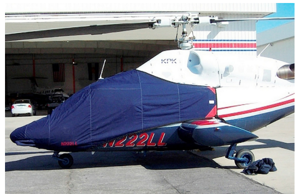
Bell 222 Bubble Cover