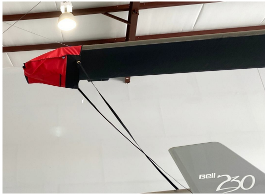
Bell 230 Blade Tie-Downs, (Semi-Rigid) W/Telescoping Attachment Handle