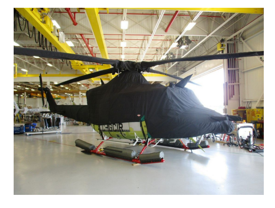
Hub & Blade Covers