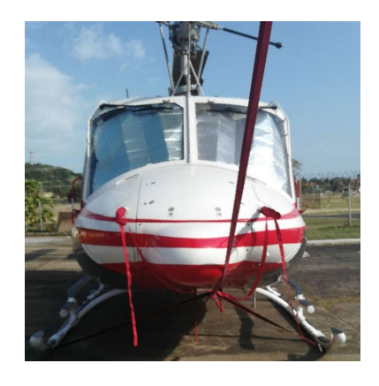
Bell 212 Windshield HeatShields

Cockpit Heatshields are interior sunshades for the aircraft's cockpit. The product is a unique composite of closed-cell foam with a silver mylar finish. The semi-rigid design is stiff enough to stand inside the window framing. Darts and folds are incorporated into the material so that it conforms to the complex shape of the helicopter windows. The set folds up flat and is easily stored in the included storage sleeve. Some designs may require velcro and suction cups. A Heatshield is an excellent short-term remedy for cockpit overheating, but an external fabric cover is more effective for long-term protection.