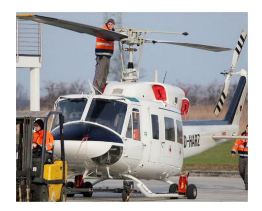
Bell 212 Main and Oil Cooler Intake Plugs

The Engine Inlet Plugs are custom fit for your Bell 212 intakes, made with heavy-duty vinyl material, and stuffed with a single block of sculpted urethane foam. Each plug has a zipper that allows the foam to be removed and dried if necessary. Engine plugs have 'Remove Before Flight' streamers sewn onto the face of the plugs. Most plugs are imprinted with the aircraft registration number in black for an extra charge. Storage bag NOT included. Engine plugs may be inserted after flight when the engine is still warm. Engine Inlet Plugs are commonly referred to as Cowl Plugs, Intake Plugs, Cowl Blocks, Engine Blocks, and Engine Bungs.