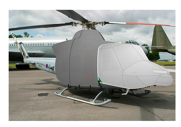
Forward Cabin Nose & Mid-Cabin/Engine Cover (extended to cross tubes)