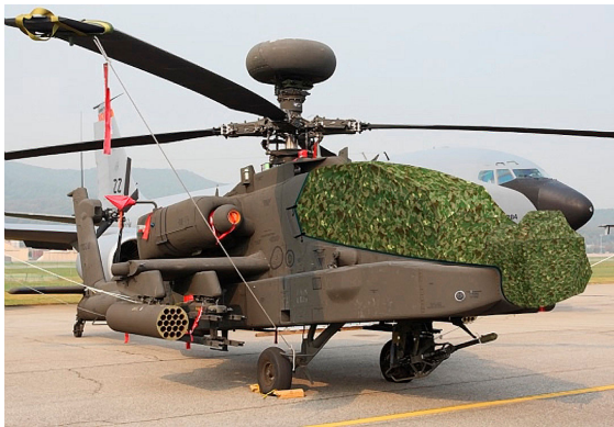
Canopy/Nose Cover, covers canopy glass and TADS

Canopy/Nose Covers enclose the entire canopy including the windshield, skylights, and chin bubble. Attachment buckles are made of nonmetal Delrin , designed for rugged outdoor use. Both the top and bottom hems of the cover have a special rope-hem feature with which they can be tightened to help prevent abrasive chafing of the windshield. Pockets are sewn into the cover for the temperature probe and pitot tubes. The bubble cover is reinforced with patches at hinge points, door handles, and for the windshield wipers. For ease of installation, the bubble cover is color-coded (red=left, green=right) with color swatches sewn into the corners. This cover type is made from Silver Acrylic Sunbrella canvas and is 100% lined with a soft and smooth microfiber. Bruce's Custom Covers developed this material combination especially for aircraft protection. The outer material is medium weight and treated for water resistance, UV resistance and anti-static buildup. The inner lining is a very soft and smooth microfiber to prevent scratching. The material is very reflective, and tests show that the cabin interior temperature can be reduced to near-ambient temperature on the hottest of days. It is water, ice and snow repellent, yet breathable to allow moisture to escape from between the cover and the aircraft surface.