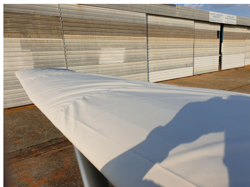
Cessna 207 Wing Covers

WINTER USE MATERIAL - Made with Solution-Dyed Polyester fabric, this option is intended for seasonal use to aid in deicing, rain mitigation, or for occasional travel. The material is lighter and more compact, but more susceptible to UV damage and may have a shorter useful life if used continuously outside than the all-year use material.