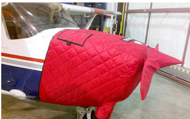
Cessna 172 Insulated Engine Cover w/ Oil Filler Door flap and Insulated Prop/Spinner Cover

This cover type is made from Silver Acrylic Sunbrella canvas and is 100% lined with a soft and smooth microfiber. Bruce's Custom Covers developed this material combination especially for aircraft protection. The outer material is medium weight and treated for water resistance, UV resistance and anti-static buildup. The inner lining is a very soft and smooth microfiber to prevent scratching. The material is very reflective, and tests show that the cabin interior temperature can be reduced to near-ambient temperature on the hottest of days. It is water, ice and snow repellent, yet breathable to allow moisture to escape from between the cover and the aircraft surface.