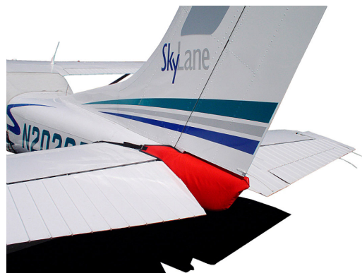
Cessna 182 Tailcone Cover