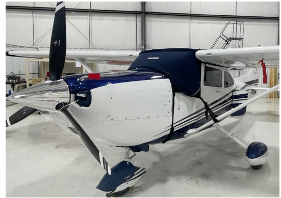
Cessna 182 Windshield Cover, Engine Plugs