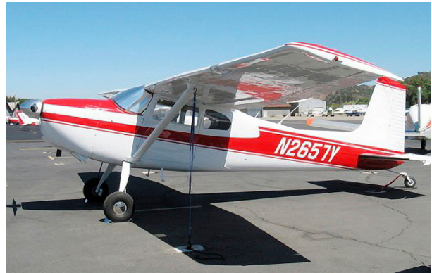
Cessna 180 & 185 Windshield HeatShield