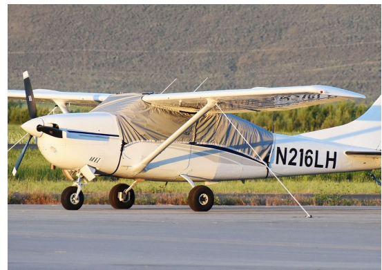
Cessna 206 Travel Cover