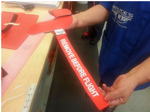
Cessna 150 Pitot Cover

be inserted after flight when the engine is still warm. Engine Inlet Plugs are commonly referred to as Cowl Plugs , Intake Plugs , Cowl Blocks , Engine Blocks , and Engine Bungs .