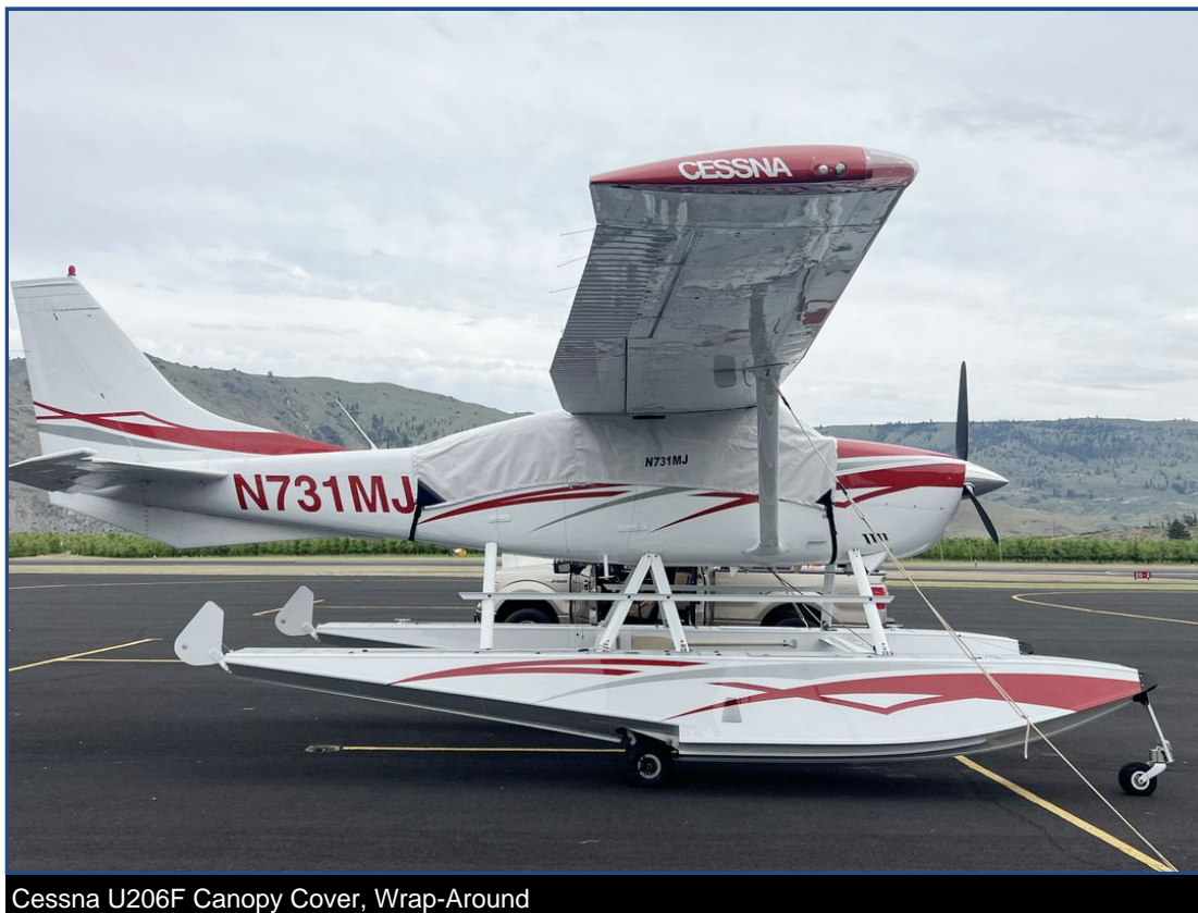
Cessna U206F Canopy Cover, Wrap-Around