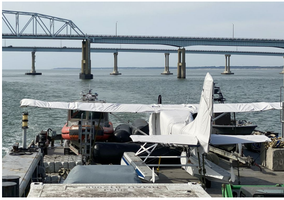
Cessna U206F Amphib Cover Set