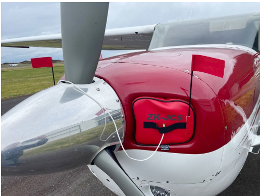
Cessna 206G Engine Plugs