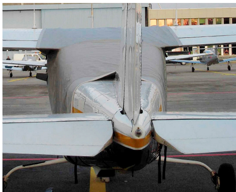
Cessna 210 Over-the-Top Canopy Cover

Travel Covers are made with Silver Solution-Dyed Polyester fabric and only lined over the windshield to save weight. The material is lightweight and more compact for easy stowage in the aircraft. The polyester material is water resistant, but only intended for occasional use outside. We also have an ultra lightweight material available for fitted hangar dust covers. For daily outdoor use, the non-travel Sunbrella Cover is the best choice.