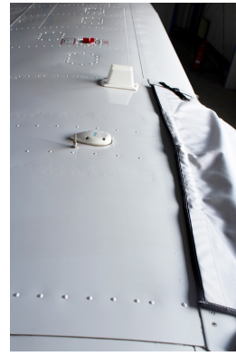
Cessna 206 Stationair Canopy Cover, Wrap-Around