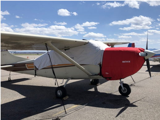
Cessna 206 Insulated Engine Cover, Canopy Cover

This cover type is made from Silver Acrylic Sunbrella canvas and is 100% lined with a soft and smooth microfiber. Bruce's Custom Covers developed this material combination especially for aircraft protection. The outer material is medium weight and treated for water resistance, UV resistance and anti-static buildup. The inner lining is a very soft and smooth microfiber to prevent scratching. The material is very reflective, and tests show that the cabin interior temperature can be reduced to near-ambient temperature on the hottest of days. It is water, ice and snow repellent, yet breathable to allow moisture to escape from between the cover and the aircraft surface.