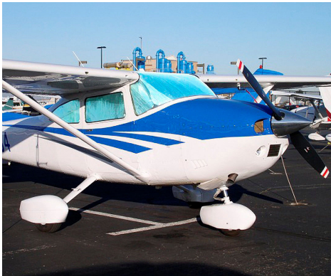
Cessna 182 HeatShield Set

Windshield Heatshields are interior sunshades for an aircraft's front windshield. The product is a unique composite of closed-cell foam with a silver mylar finish. The semi-rigid design is stiff enough to stand along the inside of the windshield using sun visors or window framing. It folds up flat and easily stores in the included storage sleeve. Some designs may require velcro and suction cups or split right and left sides. A Heatshield is an excellent short-term remedy for cockpit overheating. An external fabric cover is far more effective and practical for long-term protection.