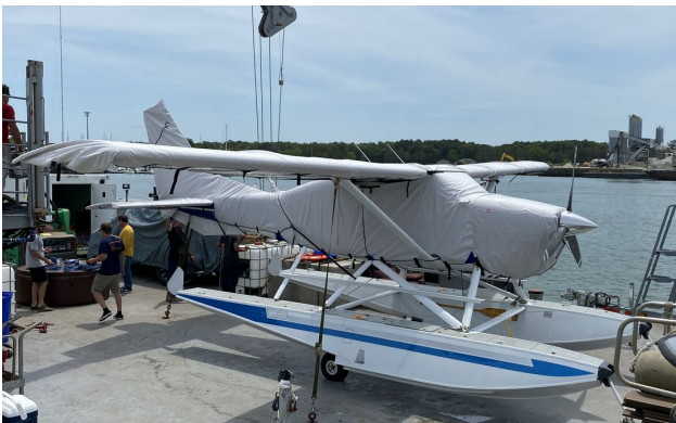
Cessna U206F Amphib Cover Set