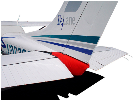
Cessna 182 Tailcone Cover

WINTER USE MATERIAL - Made with Solution-Dyed Polyester fabric, this option is intended for seasonal use to aid in deicing, rain mitigation, or for occasional travel. The material is lighter and more compact, but more susceptible to UV damage and may have a shorter useful life if used continuously outside than the all-year use material.