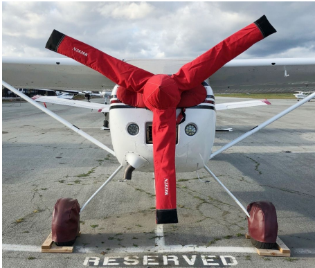
Cessna Skywagon Propellor/Spinner Cover, 3-blade type