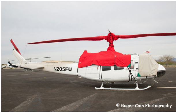
Bell 205 Engine, Rotor Mast, Blades & Forward Cabin Covers