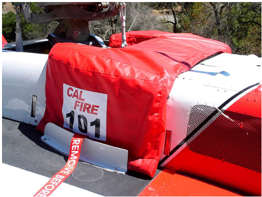
Bell 204 Intake Cover

WINTER USE MATERIAL - Made with Solution-Dyed Polyester fabric, this option is intended for seasonal use to aid in deicing, rain mitigation, or for occasional travel. The material is lighter and more compact, but more susceptible to UV damage and may have a shorter useful life if used continuously outside than the all-year use material.