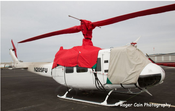
Bell 205 Engine, Rotor Mast, Blades & Forward Cabin Covers