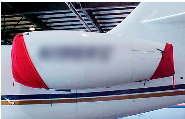
Falcon 2000 Intake/Exhaust Cover Set

The Falcon Jet 2000 Intake Covers are designed to install easily yet be completely storable. A spring steel hoop is sewn into the hem of each cover, allowing them to be installed without climbing onto the wing or using a stepladder. To store the covers the spring steel hoop folds like a band-saw blade into three nesting rings. Each cover folds into a compact circular bundle which is stored in the included duffle bag, yet they unfold quickly for use. The Tri-Fold Ring cover is made of medium weight nylon which is available in a variety of colors to match the paint trim. Each cover set comes complete with installation and folding instructions. The aircraft's registration number can be silkscreened onto the cover for an extra charge.