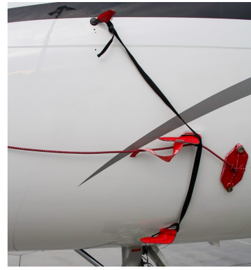
Falcon Jet 2000 Pitot Covers, Aoa's, Tat Cover Set, Heat Resistant Type