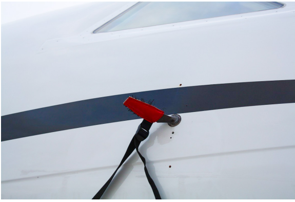
Falcon Jet 2000 Pitot Covers, Aoa's, Tat Cover Set, Heat Resistant Type