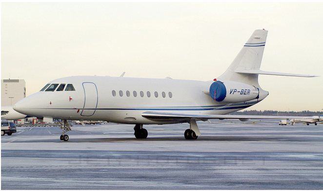
Falcon 2000 Engine Cover Set