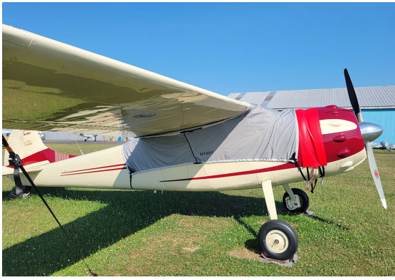
Cessna 190 Travel Cover, Light Weight Canopy Cover, Over-Top Type