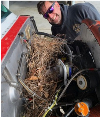
Cessna 172 Bird Nest Problem

Engine Inlet Plugs are custom fit for your Cessna 190 & 195 intakes, made with heavy-duty vinyl material, and stuffed with a single block of sculpted urethane foam. Each plug has a zipper that allows the foam to be removed and dried if necessary. Engine plugs have warning flags that are visible from the cockpit or 'remove before flight' streamers sewn onto the face of the plugs. Most plugs are imprinted with the aircraft registration number in black for an extra charge. Storage bag NOT included. Engine plugs may be inserted after flight when the engine is still warm. Engine Inlet Plugs are commonly referred to as Cowl Plugs, Intake Plugs, Cowl Blocks, Engine Blocks, and Engine Bungs.