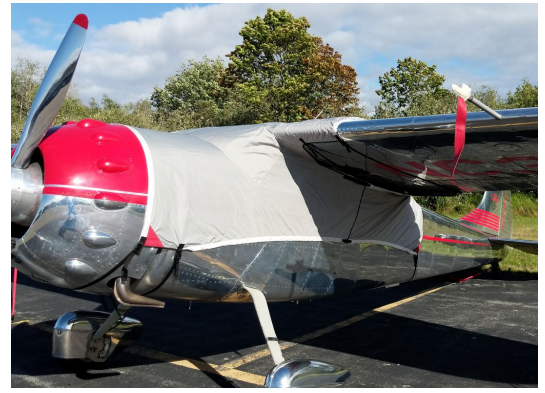
Cessna 195 Travel Weight Over-Top Canopy Cover