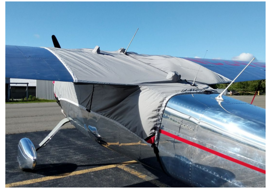
Cessna 195 Travel Weight Over-Top Canopy Cover