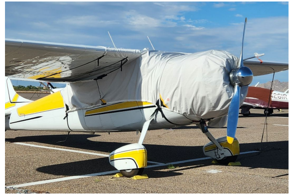
Cessna 190 & 195 Canopy Cover, Over-Top, 12" Fwd Ext, Gas Cap Ext., & Engine Cover