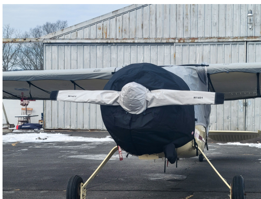
Cessna 190 Travel Canopy, Insulated Engine, Wing & Prop Covers

WINTER USE MATERIAL - Made with Solution-Dyed Polyester fabric, this option is intended for seasonal use to aid in deicing, rain mitigation, or for occasional travel. The material is lighter and more compact, but more susceptible to UV damage and may have a shorter useful life if used continuously outside than the all-year use material.