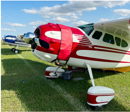
Cessna 195 Engine Cowl Ring Gap Cover

This cover type is made from Silver Acrylic Sunbrella canvas and is 100% lined with a soft and smooth microfiber. Bruce's Custom Covers developed this material combination especially for aircraft protection. The outer material is medium weight and treated for water resistance, UV resistance and anti-static buildup. The inner lining is a very soft and smooth microfiber to prevent scratching. The material is very reflective, and tests show that the cabin interior temperature can be reduced to near-ambient temperature on the hottest of days. It is water, ice and snow repellent, yet breathable to allow moisture to escape from between the cover and the aircraft surface.