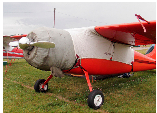
Cessna 195 Over-Top Canopy Cover & Engine Cover