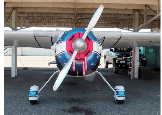
Cessna 195 Engine Inlet Plugs, set of 3