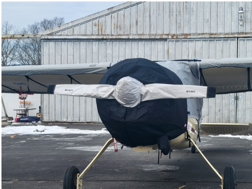
Cessna 190 Travel Canopy, Insulated Engine, Wing & Prop Covers

WINTER USE MATERIAL - Made with Solution-Dyed Polyester fabric, this option is intended for seasonal use to aid in deicing, rain mitigation, or for occasional travel. The material is lighter and more compact, but more susceptible to UV damage and may have a shorter useful life if used continuously outside than the all-year use material.