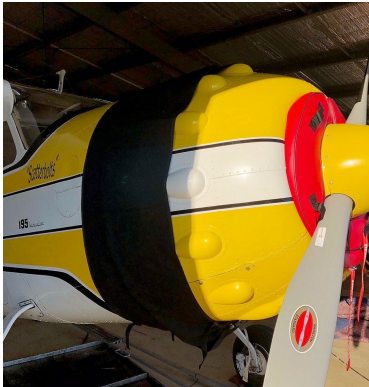
Cessna 195 Engine Plugs, Cowl Ring Gap Cover