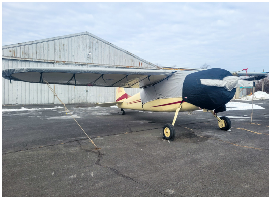
Cessna 190 Travel Canopy, Insulated Engine, Wing & Prop Covers