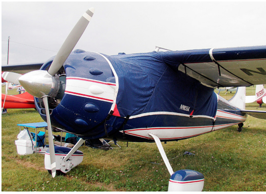
Cessna 195 Canopy Cover, extended forward and over gas caps