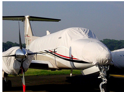
King Air 350 Canopy/Nose Cover, Engine Covers