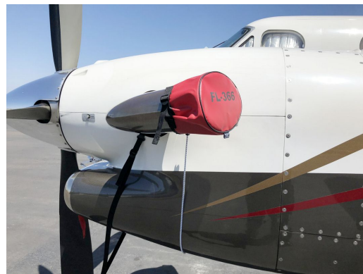
Beech King Air 350 Prop Tie-Downs/Exhaust Covers Combination