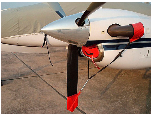
Prop Tie-down/Exhaust Covers

This cover type is made from Silver Acrylic Sunbrella canvas and is 100% lined with a soft and smooth microfiber. Bruce's Custom Covers developed this material combination especially for aircraft protection. The outer material is medium weight and treated for water resistance, UV resistance and anti-static buildup. The inner lining is a very soft and smooth microfiber to prevent scratching. The material is very reflective, and tests show that the cabin interior temperature can be reduced to near-ambient temperature on the hottest of days. It is water, ice and snow repellent, yet breathable to allow moisture to escape from between the cover and the aircraft surface.