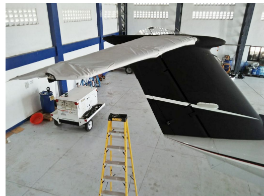
Beech King Air B350 Horizontal Stabilizer Covers