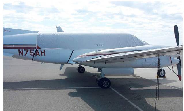
King Air 350 Canopy Cover