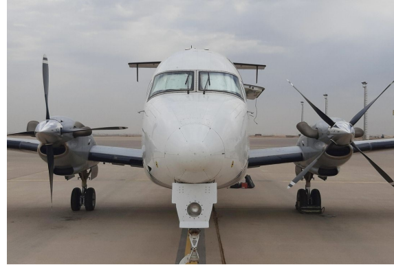
Raytheon 1900D Cockpit HeatShields