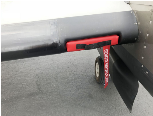
Beech King Air Heat Exchanger Inlet Plug

Engine Inlet Plugs are custom fit for your Beech 1900D intakes, made with heavy-duty vinyl material, and stuffed with a single block of sculpted urethane foam. Each plug has a zipper that allows the foam to be removed and dried if necessary. Engine plugs have warning flags that are visible from the cockpit or 'remove before flight' streamers sewn onto the face of the plugs. Most plugs are imprinted with the aircraft registration number in black for an extra charge. Storage bag NOT included. Engine plugs may be inserted after flight when the engine is still warm. Engine Inlet Plugs are commonly referred to as Cowl Plugs, Intake Plugs, Cowl Blocks, Engine Blocks, and Engine Bungs.