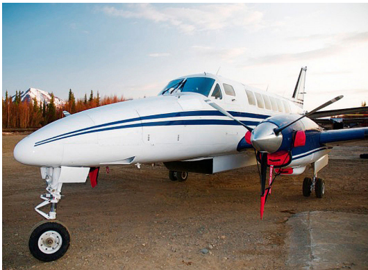
Beech 99 Engine Plugs & Prop Ties

Engine Inlet Plugs are custom fit for your Beech 1900D intakes, made with heavy-duty vinyl material, and stuffed with a single block of sculpted urethane foam. Each plug has a zipper that allows the foam to be removed and dried if necessary. Engine plugs have warning flags that are visible from the cockpit or 'remove before flight' streamers sewn onto the face of the plugs. Most plugs are imprinted with the aircraft registration number in black for an extra charge. Storage bag NOT included. Engine plugs may be inserted after flight when the engine is still warm. Engine Inlet Plugs are commonly referred to as Cowl Plugs, Intake Plugs, Cowl Blocks, Engine Blocks, and Engine Bungs.