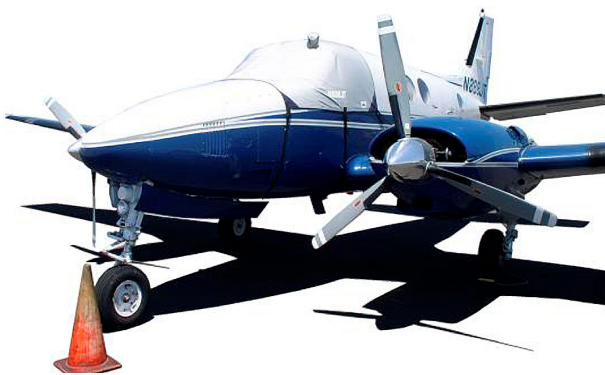
King Air Cockpit Cover, belly-strap type

The Beech 1900D Nose Cover is designed to cover the section of the fuselage forward of the windshield to the tip of the nose. It is secured with belly straps. This cover type is made from Silver Acrylic Sunbrella canvas and is 100% lined with a soft and smooth microfiber. Bruce's Custom Covers developed this material combination especially for aircraft protection. The outer material is medium weight and treated for water resistance, UV resistance and anti-static buildup. The inner lining is a very soft and smooth microfiber to prevent scratching. The material is very reflective, and tests show that the cabin interior temperature can be reduced to near-ambient temperature on the hottest of days. It is water, ice and snow repellent, yet breathable to allow moisture to escape from between the cover and the aircraft surface.