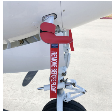
Beech King Air Pitot Covers