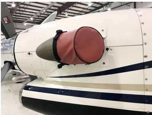
Beech King Air 350 Exhaust Covers

This cover type is made from Silver Acrylic Sunbrella canvas and is 100% lined with a soft and smooth microfiber. Bruce's Custom Covers developed this material combination especially for aircraft protection. The outer material is medium weight and treated for water resistance, UV resistance and anti-static buildup. The inner lining is a very soft and smooth microfiber to prevent scratching. The material is very reflective, and tests show that the cabin interior temperature can be reduced to near-ambient temperature on the hottest of days. It is water, ice and snow repellent, yet breathable to allow moisture to escape from between the cover and the aircraft surface.