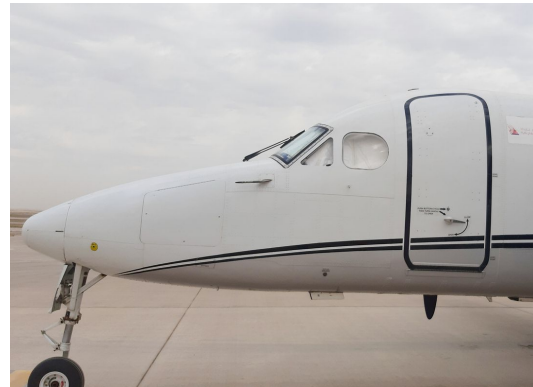
Raytheon 1900D Cockpit HeatShields