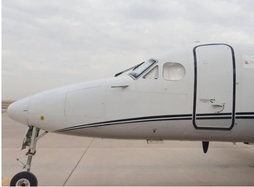
Raytheon 1900D Cockpit HeatShields

Cockpit Heatshields are interior sunshades for the aircraft's cockpit. The product is a unique composite of closed-cell foam with a silver mylar finish. The semi-rigid design is stiff enough to stand inside the window framing. The set folds up flat and is easily stored in the included storage sleeve. Some designs may require velcro and suction cups. A Heatshield is an excellent short-term remedy for cockpit overheating, but an external fabric cover is more effective for long-term protection.