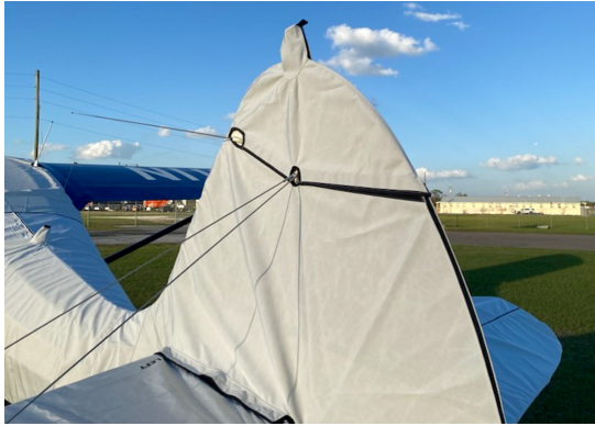
Aeronca Sedan Empennage Cover (Tailboom, Vertical & Horizontal Stabilizers), All Year Use

shorter useful life if used continuously outside than the all-year use material.