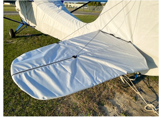
Aeronca Sedan Empennage Cover (Tailboom, Vertical & Horizontal Stabilizers), All Year Use