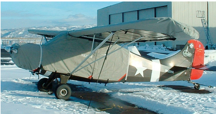
Extended Canopy Cover, Engine & Wing Covers