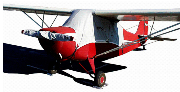
Aeronca Champ Canopy & Prop Covers

This cover type is made from Silver Acrylic Sunbrella canvas and is 100% lined with a soft and smooth microfiber. Bruce's Custom Covers developed this material combination especially for aircraft protection. The outer material is medium weight and treated for water resistance, UV resistance and anti-static buildup. The inner lining is a very soft and smooth microfiber to prevent scratching. The material is very reflective, and tests show that the cabin interior temperature can be reduced to near-ambient temperature on the hottest of days. It is water, ice and snow repellent, yet breathable to allow moisture to escape from between the cover and the aircraft surface.