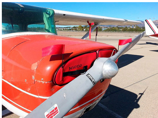
Cessna 150 Engine Plugs, Pitot Cover

Engine Inlet Plugs are custom fit for your Cessna 150 & 152 intakes, made with heavy-duty vinyl material, and stuffed with a single block of sculpted urethane foam. Each plug has a zipper that allows the foam to be removed and dried if necessary. Engine plugs have warning flags that are visible from the cockpit or 'remove before flight' streamers sewn onto the face of the plugs. Most plugs are imprinted with the aircraft registration number in black for an extra charge. Storage bag NOT included. Engine plugs may be inserted after flight when the engine is still warm. Engine Inlet Plugs are commonly referred to as Cowl Plugs, Intake Plugs, Cowl Blocks, Engine Blocks, and Engine Bungs.