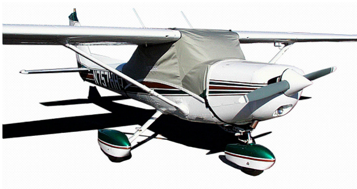
Cessna 150 Canopy Cover

This cover type is made from Silver Acrylic Sunbrella canvas and is 100% lined with a soft and smooth microfiber. Bruce's Custom Covers developed this material combination especially for aircraft protection. The outer material is medium weight and treated for water resistance, UV resistance and anti-static buildup. The inner lining is a very soft and smooth microfiber to prevent scratching. The material is very reflective, and tests show that the cabin interior temperature can be reduced to near-ambient temperature on the hottest of days. It is water, ice and snow repellent, yet breathable to allow moisture to escape from between the cover and the aircraft surface.