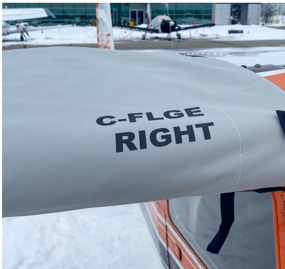
Cessna 150 & 152 Wing Covers, Winter Use

WINTER USE MATERIAL - Made with Solution-Dyed Polyester fabric, this option is intended for seasonal use to aid in deicing, rain mitigation, or for occasional travel. The material is lighter and more compact, but more susceptible to UV damage and may have a shorter useful life if used continuously outside than the all-year use material.