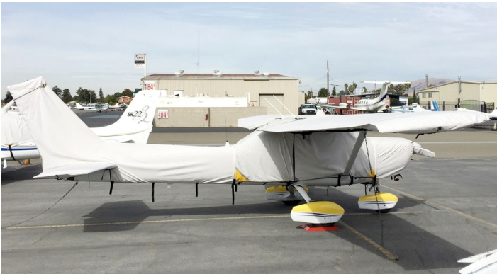
Cessna 150 Extended Canopy, Wing, Prop, and Empennage Cover

This cover type is made from Silver Acrylic Sunbrella canvas and is 100% lined with a soft and smooth microfiber. Bruce's Custom Covers developed this material combination especially for aircraft protection. The outer material is medium weight and treated for water resistance, UV resistance and anti-static buildup. The inner lining is a very soft and smooth microfiber to prevent scratching. The material is very reflective, and tests show that the cabin interior temperature can be reduced to near-ambient temperature on the hottest of days. It is water, ice and snow repellent, yet breathable to allow moisture to escape from between the cover and the aircraft surface.