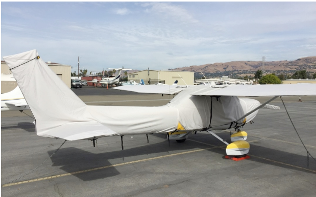
Cessna 150 Extended Canopy, Wing, Prop, and Empennage Cover