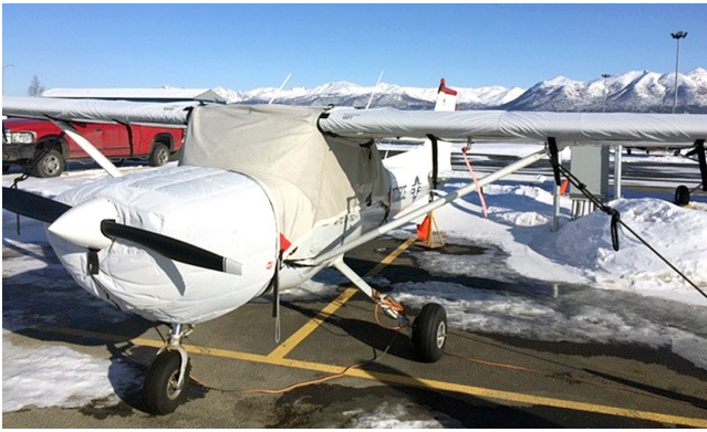
Cessna 150 Over-the-Top Canopy Cover