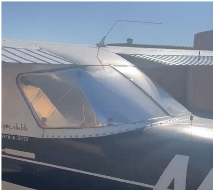
Cessna 150 Cabin HeatShields

Windshield Heatshields are interior sunshades for an aircraft's front windshield. The product is a unique composite of closed-cell foam with a silver mylar finish. The semi-rigid design is stiff enough to stand along the inside of the windshield using sun visors or window framing. It folds up flat and easily stores in the included storage sleeve. Some designs may require velcro and suction cups or split right and left sides. A Heatshield is an excellent short-term remedy for cockpit overheating. An external fabric cover is far more effective and practical for long-term protection.