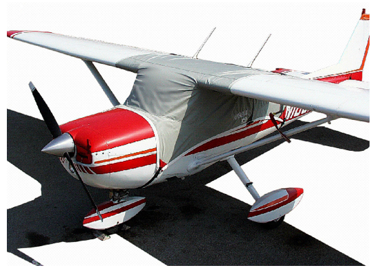
Cessna 150 Over-the-Top Canopy Cover