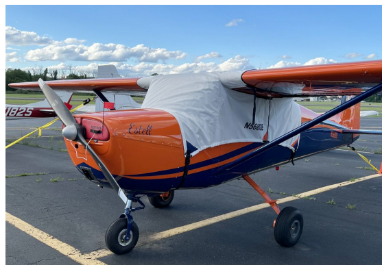
Cessna 150 Over-Top Canopy Cover, Engine Plugs