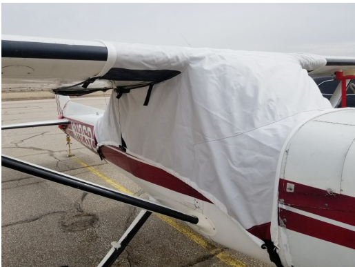
Cessna 150L Over The Top Canopy Cover