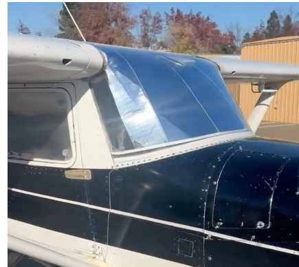
Cessna 150 Cabin HeatShields