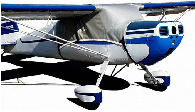
Cessna 120 Over-Top Canopy Cover