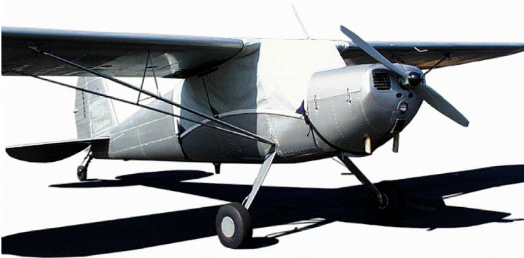
Cessna 120 Over-Top Canopy Cover

This cover type is made from Silver Acrylic Sunbrella canvas and is 100% lined with a soft and smooth microfiber. Bruce's Custom Covers developed this material combination especially for aircraft protection. The outer material is medium weight and treated for water resistance, UV resistance and anti-static buildup. The inner lining is a very soft and smooth microfiber to prevent scratching. The material is very reflective, and tests show that the cabin interior temperature can be reduced to near-ambient temperature on the hottest of days. It is water, ice and snow repellent, yet breathable to allow moisture to escape from between the cover and the aircraft surface.