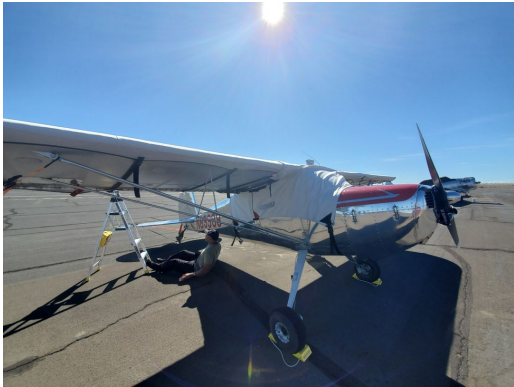
Cessna 140 Over The Top Style Canopy Cover

WINTER USE MATERIAL - Made with Solution-Dyed Polyester fabric, this option is intended for seasonal use to aid in deicing, rain mitigation, or for occasional travel. The material is lighter and more compact, but more susceptible to UV damage and may have a shorter useful life if used continuously outside than the all-year use material.