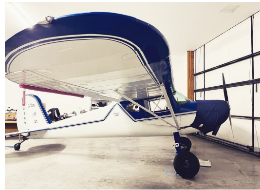
Cessna 140 Insulated Engine Cover