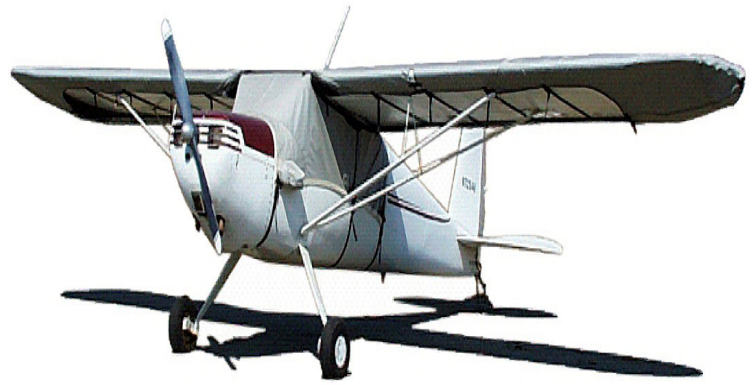
Cessna 120 Canopy Cover & Wing Covers