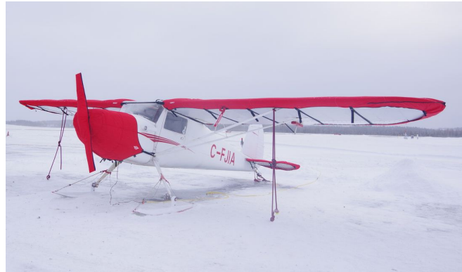
Cessna 120 Insulated Engine & Prop Covers, Wing & Tail Covers