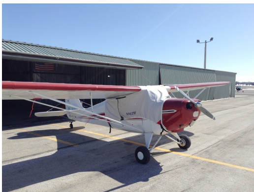
Aeronca Chief Canopy Cover

This cover type is made from Silver Acrylic Sunbrella canvas and is 100% lined with a soft and smooth microfiber. Bruce's Custom Covers developed this material combination especially for aircraft protection. The outer material is medium weight and treated for water resistance, UV resistance and anti-static buildup. The inner lining is a very soft and smooth microfiber to prevent scratching. The material is very reflective, and tests show that the cabin interior temperature can be reduced to near-ambient temperature on the hottest of days. It is water, ice and snow repellent, yet breathable to allow moisture to escape from between the cover and the aircraft surface.