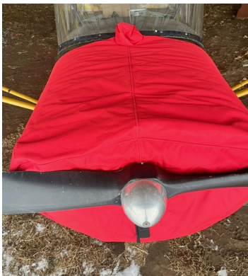
Aeronca 11AC Chief Insulated Engine Cover

This cover type is made from Silver Acrylic Sunbrella canvas and is 100% lined with a soft and smooth microfiber. Bruce's Custom Covers developed this material combination especially for aircraft protection. The outer material is medium weight and treated for water resistance, UV resistance and anti-static buildup. The inner lining is a very soft and smooth microfiber to prevent scratching. The material is very reflective, and tests show that the cabin interior temperature can be reduced to near-ambient temperature on the hottest of days. It is water, ice and snow repellent, yet breathable to allow moisture to escape from between the cover and the aircraft surface.