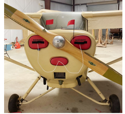
Aeronca 11CC Super Chief Engine Plugs, Extended Canopy Cover (also covers gas caps) Aeronca 11AC Chief Engine Plugs