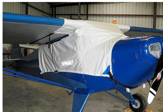
Taylorcraft BC12-D Over-the-top Canopy Cover