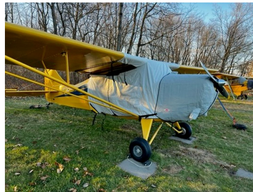
Aeronca Super Chief 11CC Extended Over-Top Canopy Cover, Insulated Engine Cover