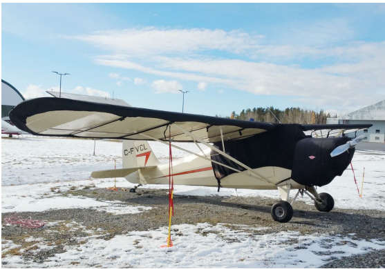
Aeronca Chief 11AC Canopy, Insulated Engine, & Wing Covers

WINTER USE MATERIAL - Made with Solution-Dyed Polyester fabric, this option is intended for seasonal use to aid in deicing, rain mitigation, or for occasional travel. The material is lighter and more compact, but more susceptible to UV damage and may have a shorter useful life if used continuously outside than the all-year use material.