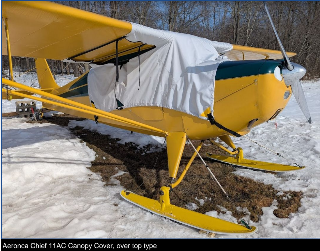
Aeronca Chief 11AC Canopy Cover, over top type