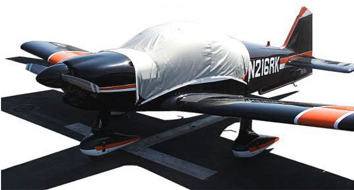
Robin R.2160 Canopy Cover

Travel Covers are made with Silver Solution-Dyed Polyester fabric and only lined over the windshield to save weight. The material is lightweight and more compact for easy stowage in the aircraft. The polyester material is water resistant, but only intended for occasional use outside. We also have an ultra lightweight material available for fitted hangar dust covers. For daily outdoor use, the non-travel Sunbrella Cover is the best choice.