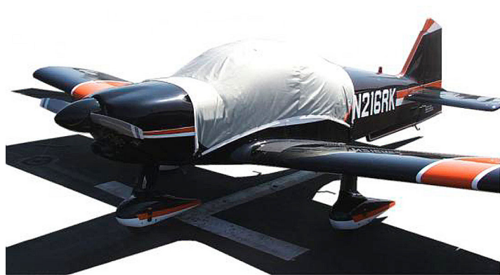
Robin R.2160 Canopy Cover