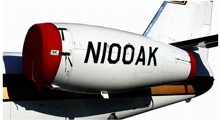
IAI Astra Engine Cover Set