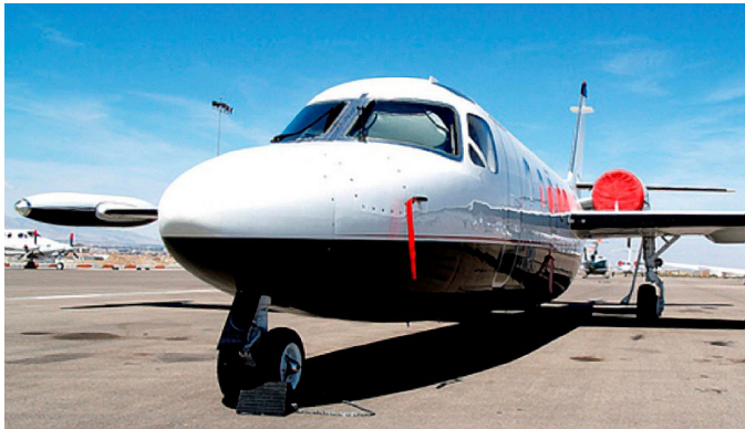
Westwind Engine Cover Set, Pitot Cover

instructions. The aircraft's registration number can be silkscreened onto the cover for an extra charge.