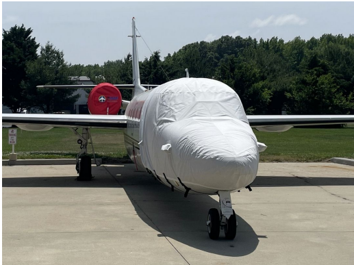
IAI 1124 Cockpit/Nose Cover Extended Aft Over Entry Door

This cover type is made from Silver Acrylic Sunbrella canvas and is 100% lined with a soft and smooth microfiber. Bruce's Custom Covers developed this material combination especially for aircraft protection. The outer material is medium weight and treated for water resistance, UV resistance and anti-static buildup. The inner lining is a very soft and smooth microfiber to prevent scratching. The material is very reflective, and tests show that the cabin interior temperature can be reduced to near-ambient temperature on the hottest of days. It is water, ice and snow repellent, yet breathable to allow moisture to escape from between the cover and the aircraft surface.