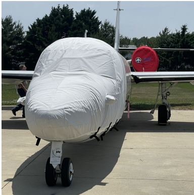
IAI 1124 Cockpit/Nose Cover Extended Aft Over Entry Door