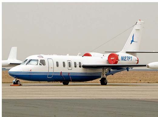
Engine Covers & Cockpit HeatShields

The Israel Aircraft Westwind 1123 Bikini Style Engine Covers are a single-piece design using a soft and smooth stretchy and fabric. The cover stretches tightly over both the intake and exhaust, installing quickly and easily. These covers are designed to be used as hangar dust covers and have a useful life of approximately one year.