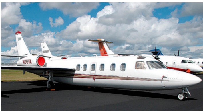
Westwind Engine Intake Plugs